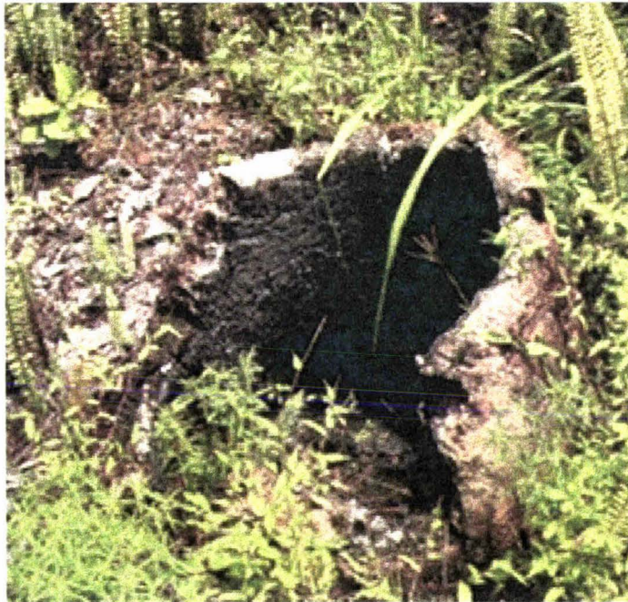
Figure 2: Abandoned native copper smelter fashioned from a termite hill at Luisha colonised by Haumaniastrum katangense (not in flower) and the fern Nephrolepis undulata .

The Zaïrean copper flower Haumaniastrum katangense can also be used to indicate the presence of archaeological remains beneath the soil. Artisans of the 14 th Century Kabambian culture of what is now Shaba Province, Democratic Republic of Congo (Zaire) used to smelt copper to produce copper crosses that were used for currency. The smelters were fashioned from abandoned termite mounds and copper ores were brought to the site from elsewhere. After several years, the termite hills weathered to ground level and the residual copper ore formed a toxic ring around the original smelters. This toxic soil became colonised by H. katangense and the sites were later recognisable as bare open areas in the savanna. Archaeologists digging below the carpet of this hyperaccumulator of copper have been able to uncover numerous artifacts from the Kabambian and later cultures (Figure 2).