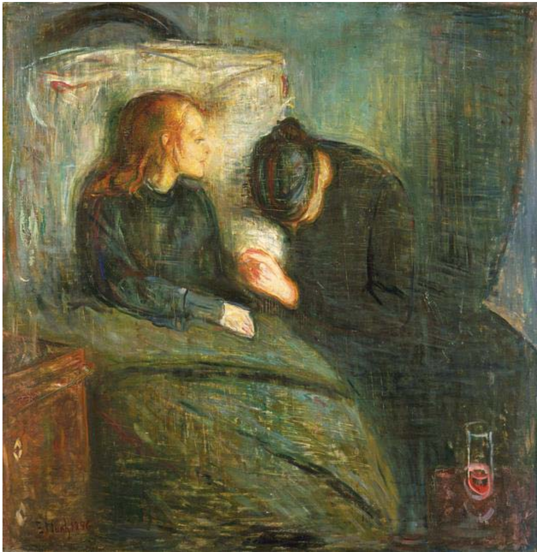
Edvard Munch, The Sick Child , 1885-86, oil on canvas, (Oslo, Norway: The National Gallery)

This painting is said to reflect the death of Munch's sister, Sophie, who died in 1877 at the age of 15 from tuberculosis. The mother is based on Munch's aunt, Karen Bjølstad. Munch's own mother had died in 1868 also from tuberculosis.