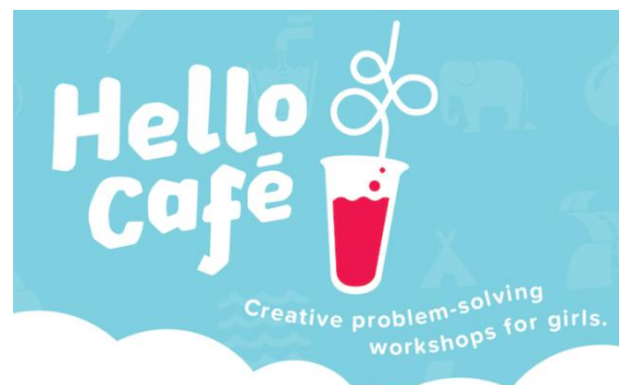
FIGURE 1 THE BRANDING OF THE OUTREACH PROGRAM

To ensure we sparked interest from this target group of young girls, we took an unusual approach about how we marketed our program. Typically large/national outreach programs targeted at girls tend to have a similar marketing approach. Usually the name of the program has some connotation with science or technology and it is very clear from the outset that the program supports STEM. For example, “Techbridge” 17 began as a program of the Chabot Space & Science Centre in California, which “inspires girls to discover a passion for technology, science and engineering. Through hands-on learning, we empower the next generation of innovators and leaders”. We specifically marketed our program so that on first impression girls would not associate it with engineering or technology. We call this “engineering education by stealth”. For example, we have purposely chosen the name “Hello Café” 18 as we wished it to convey a welcoming program in an environment that is relaxed and friendly. Our brand is fun, using colors that young girls can typically connect with (Figure 1).