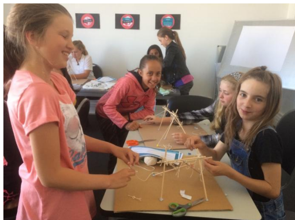
FIGURE 2 THE GIRLS MAKE SHELTERS AS A PART OF THE RELIEF SHELTER WORKSHOP

The overall concept of the design of the suite of 10 workshops is that we approached engineering and technology in an indirect manner. During each workshop we gradually built the girls’ connection with engineering by focusing on “helping people first”, rather than using “engineering” as the focus; again using this “engineering education by stealth” strategy. We wanted the girls to come out of the experience excited and amazed about what engineering could do and more importantly where they felt confident that they could actually “do” engineering by having real hands-on experience of solving problems (Figure 2). We wanted them to challenge the stereotype that engineering is “dirty” and it’s what men do. We wanted them to feel that they can break-down what society thinks about what young girls should do by having long-term, continued support from a real woman engineer who became their mentor.