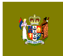
Warrant Officer Class One