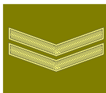
Corporal or Bombardier (RNZA only)