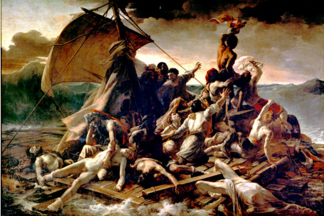
Image Four: Erich Lessing 'The Raft of the Medusa' retrieved on August 01, 2013 from:

http://online.wsj.com/news/articles/SB10001424052970204119704574236393080650258