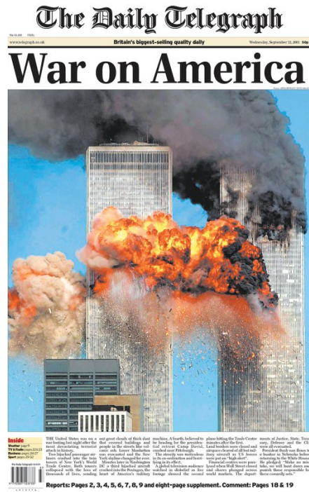
Image Eleven: Uncredited ‘War on America’ retrieved on May 22, 2014 from: http://bkeulitt.wordpress.com/