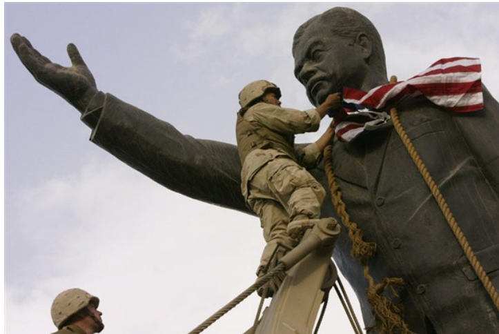
Image Twenty - Two: Jerome Delay 'Cover Up' retrieved on May 10, 2014 from: http://news.xin.msn.com/en/silverlight-gallery.aspx?cp-documentid=5225258&page=17

http://www.theguardian.com/artanddesign/2010/nov/13/jeremy-paxman-photograph-decade