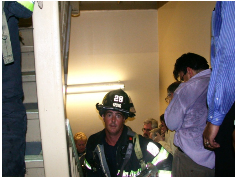
Image Fourteen: John Labriola 'Fireman in the Stairwell' retrieved September 13, 2013 from: http://media.cleveland.com/science_impact/photo/firefighter-mike-kehoe-in-wtc1-stairwelljpg-581a956b1ab99dbd.jpg