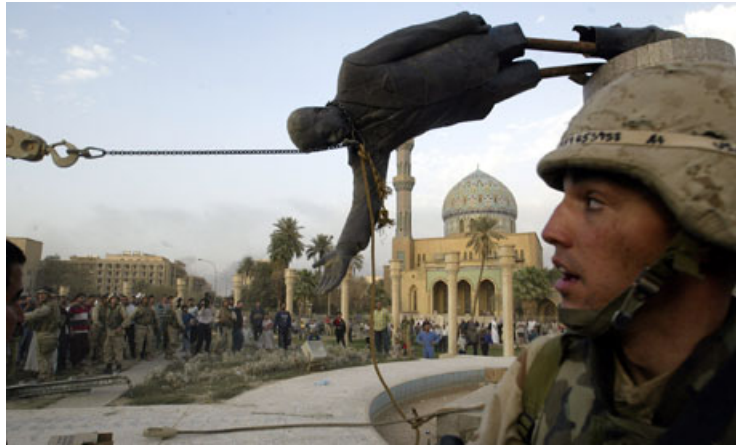
Image Twenty - One: Jerome Delay 'Saddam's finale' retrieved on May 10, 2014 from:

http://www.theguardian.com/artanddesign/2010/nov/13/jeremy-paxman-photograph-decade