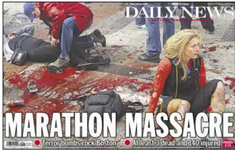
Image Twenty - Eight: 'Marathon Massacre' retrieved on May 04, 2014 from