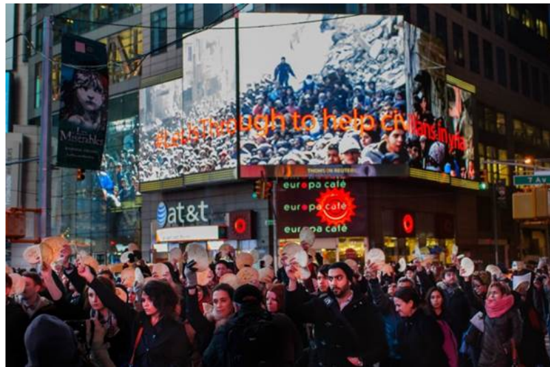
Image Thirty -Three: URNWA ‘Times Square’