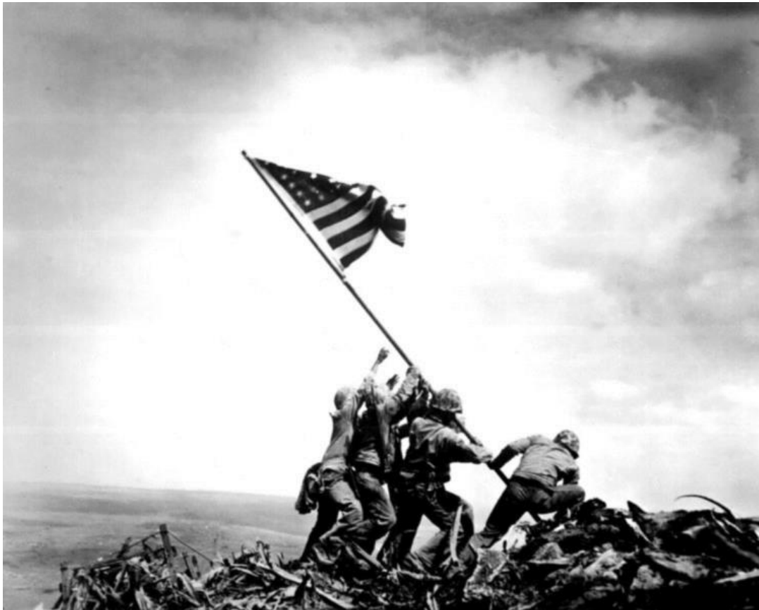
Image one: Joe Rosenthal, 'Iwo Jima Flag Raising' retrieved on August 01, 2013 from: http://www.montney.com/marine/iwo.htm