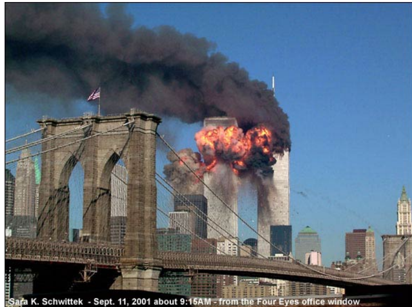
Image Twelve: Sara K. Schwittek ‘Twin Towers New York City’ retrieved on March 01, 2013 from: http://www.foureyes.com/towers/