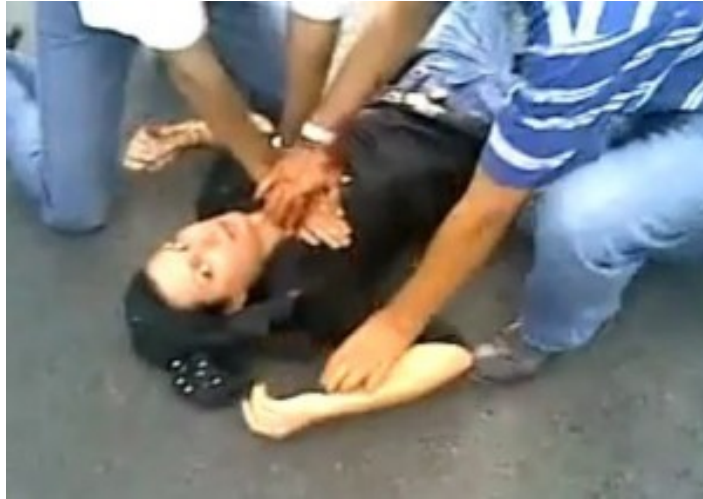
Image Sixteen: Anonymous bystander ‘Voice of Iran’ retrieved on September 13, 2013 from: http://www.ruhrbarone.de/the-story-of-neda-soltani-a-story-of-what-media-can-do-to-a-person/5663