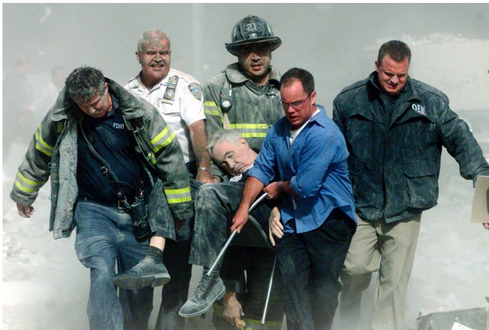
Image Thirteen: Shannon Stapleton ‘America Pieta’ retrieved on September 15, 2013 from: http://shannonstapleton.com/#/911/sept4