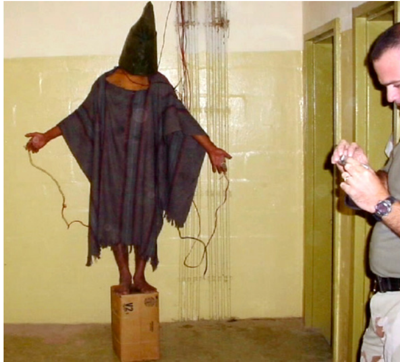
Image Twenty - Four: 'Unedited Hooded Man'