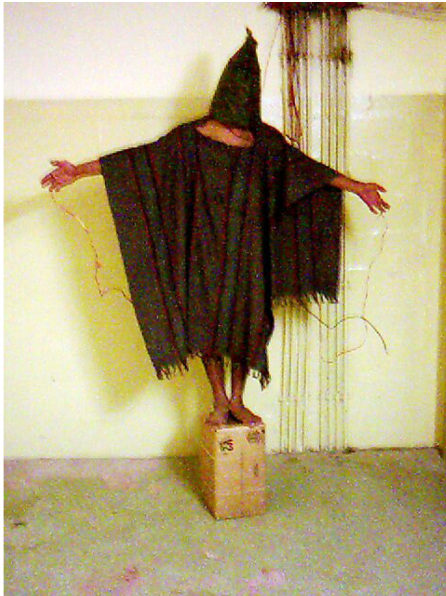
Image Twenty - Three: Unconfirmed Photographer. “Hooded Man’ retrieved on August 14, 2013 from: http://www.mintpressnews.com/tomgram-karen-greenberg-abu-ghraib-never-left-us/189728/