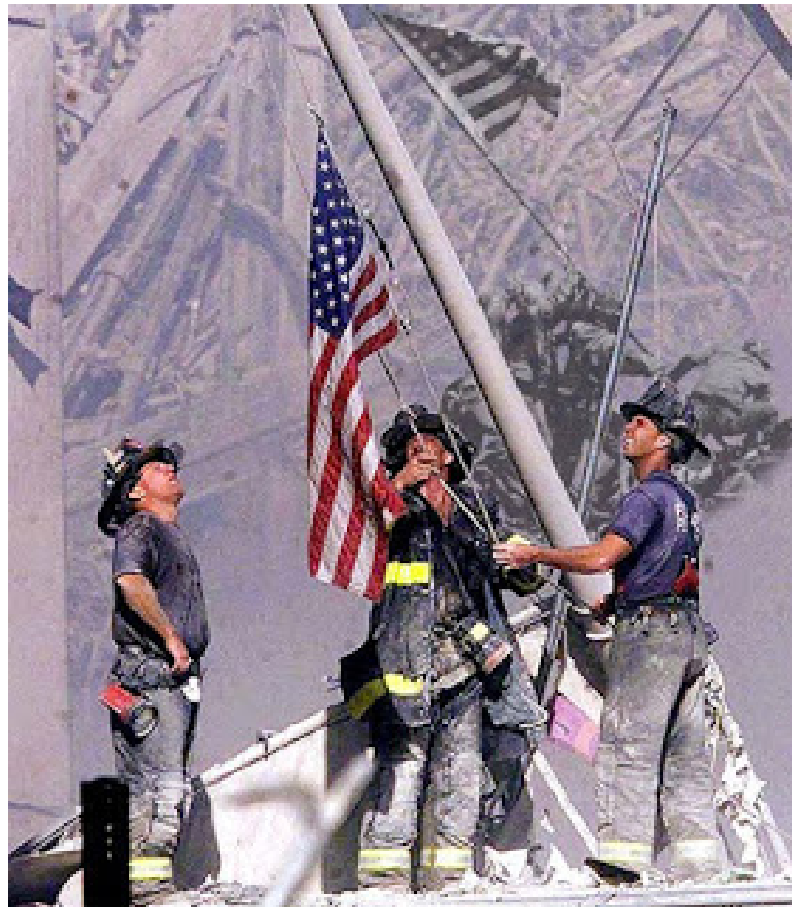
Image Fifteen: Thomas E. Franklin 'Flag Photo' retrieved September 15, 2013 from: http://respondingthroughart.blogspot.co.nz/2012/04/flag-mania-reading-assignment.html