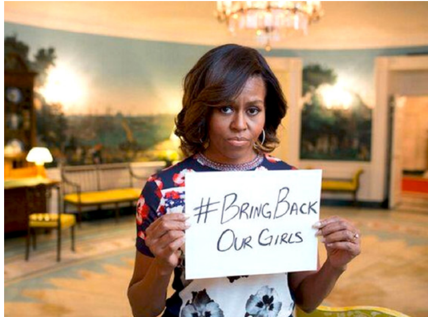
Image Thirty - One: Michelle Obama 'Twitter Motivation'