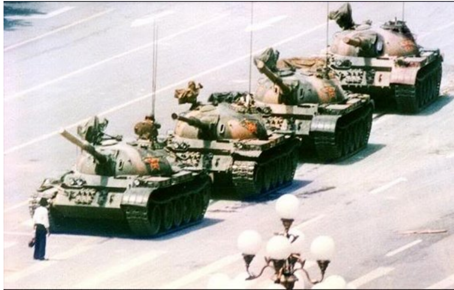
Image Eight: Jeff Widener ‘Tank Man’ retrieved on March 15, 2013 from: http://brainz.org/10-color-photographs-changed-world/