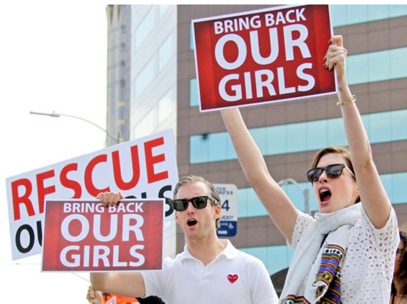
'Hathaway Protest' retrieved on May 12, 2014 from: http://au.eonline.com/news/540004/bringbackourgirls-michelle-obama-kim-kardashian-and-more-join-campaign-for-kidnapped-nigerian-schoolgirls