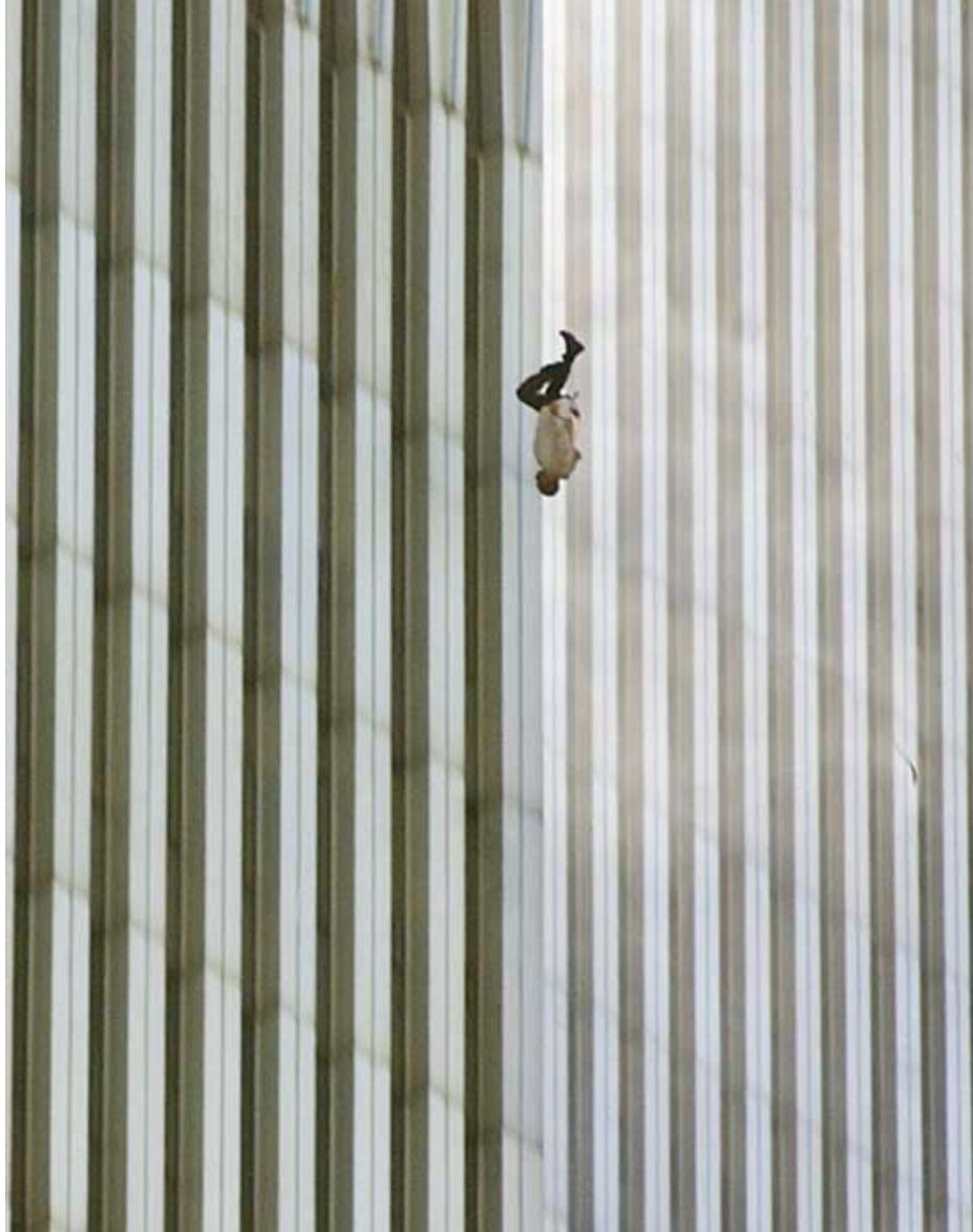
Image Ten: Richard Drew 'Falling Man' retrieved on March 15, 2013 from: http://brainz.org/10-color-photographs-changed-world/