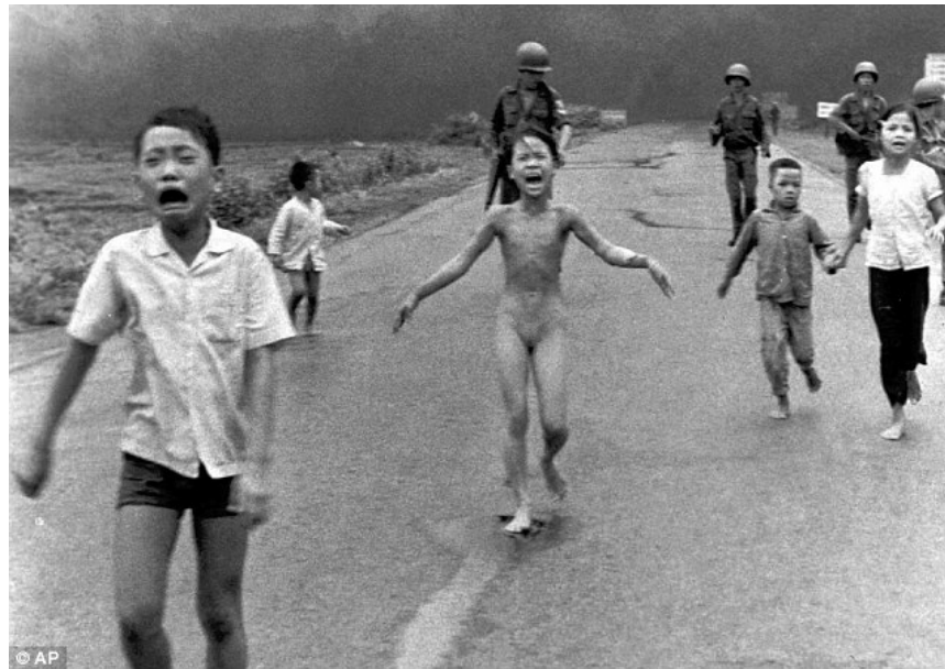
Image five: Nick Ut ‘Napalm Attack’