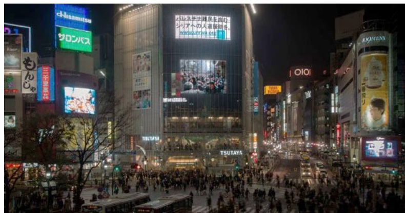
Image Thirty Four: UNWRA ‘Tokyo’