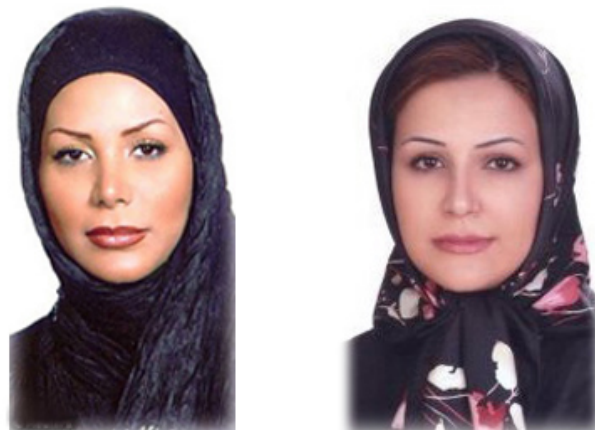
Image Seventeen: Von David Schraven ‘The Two Neda’s’ retrieved on September 13, 2013 from: http://www.ruhrbarone.de/the-story-of-neda-soltani-a-story-of-what-media-can-do-to-a-person/5663