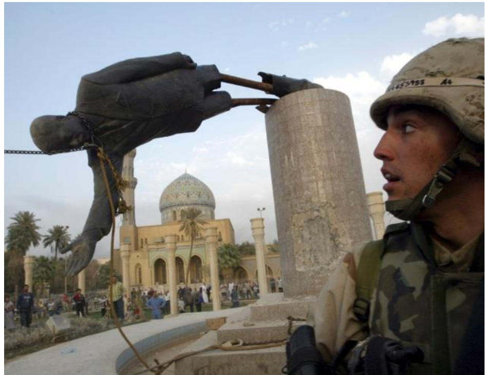
Image Eighteen: Goran Tomasevic 'Soldier Watches Toppling' retrieved on September 15, 2013 from: http://news.ca.msn.com/iconic-images-of-war-and-peace?page=11