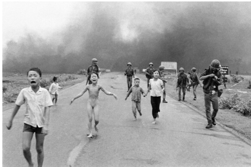
Image Six: Nick Ut ‘The Original Napalm Girl’ retrieved on August 01, 2013 from: http://www.the.me/should-a-photographer-in-conflict-zones-help-the-true-story-of-the-napalm-girl-image/