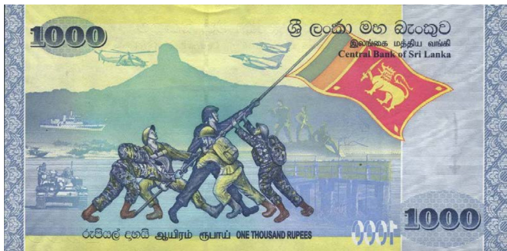
Image three: U.S. Naval Institute “Sri Lanka’s Central Bank 1000 Rupee note circulated in 2009’ retrieved on August 01, 2009 from: http://www.usni.org/iwo-jima-parody-photos