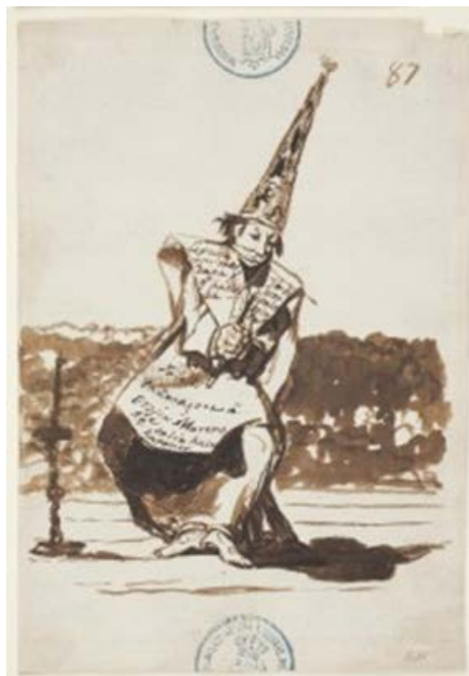
Image Twenty - Seven: Francisco José de Goya y Lucientes 'Goya's Inquisition: from Black Legend to Liberal Legend'