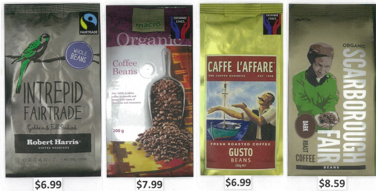
Figure 1: Examples of the Conjoint Cards Used

Brand and logo were treated as categorical variables while price was estimated using a linear model. The total number of combinations equalled 36 (4x3x3). To reduce respondents fatigue related to the ranking task, this research applied a fractional factorial design that generated 16 profiles. Respondents ranked these profiles in the order from the most preferable option to the least preferable option. A convenience sample of 50 participants was randomly recruited through a mall intercept. Data was collected in the city centre of Palmerston North (a centre that serves both urban and surrounding rural communities), New Zealand in July 2014. The sample comprised mixed ages, and gender was split 54% females and 46% males.