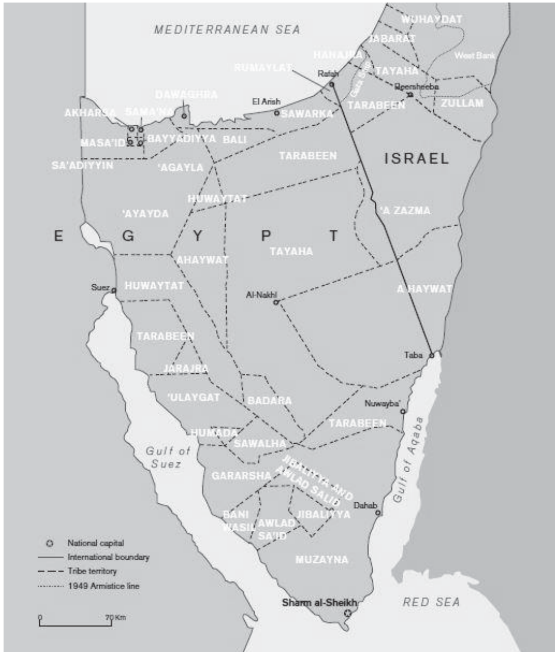
Figure 1 Historical distribution of Sinai's Bedouin tribes

Arabic and have different physical features, including being generally darker skinned, which further distinguishes them from the Egyptian majority.