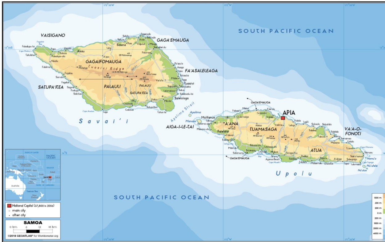
Figure 2: Map of Samoa