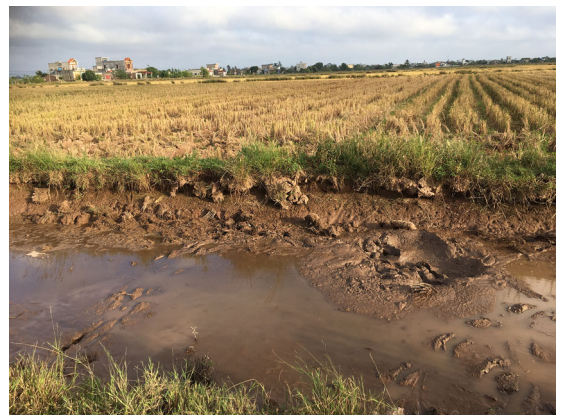
Figure 3. Riverbank without rice cultivation in other community in Thai Binh province (photo taken 23rd November 2017) [Colour figure can be viewed at wileyonlinelibrary.com ]