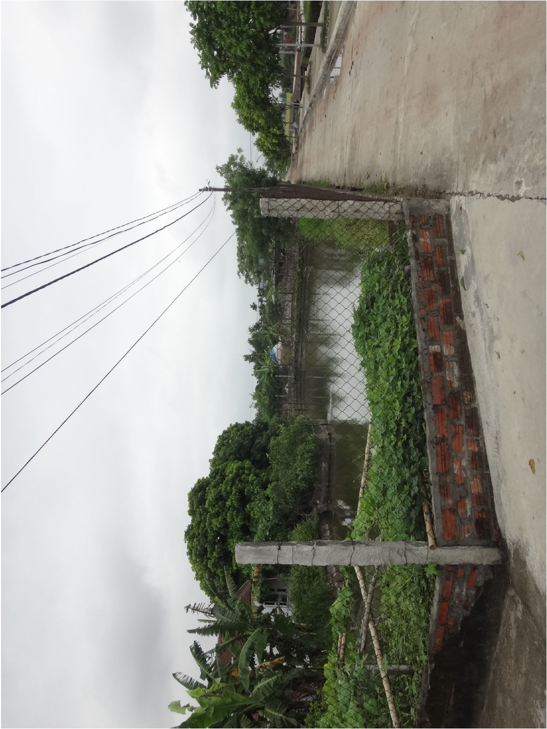
Figure 4. Private pond surrounded by high wire mesh in Quoc Tuan (Photo taken 20th June 2016) [Colour figure can be viewed at wileyonlinelibrary.com ]