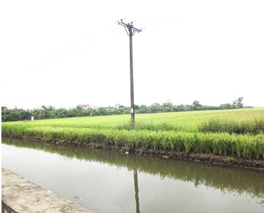
Figure 2. Riverbank with rice cultivation in Quoc Tuan (Photo taken 20th June 2016) [Colour figure can be viewed at wileyonlinelibrary.com ]

These strategies for climate change adaptation are part of a long history of adaptive practices in this part of the world. As such, local farmers in Quoc Tuan have long been fluent in the approach of sống chung với lũ / 'Living with the flood' (Miller, 2018). This concept is well-known livelihood strategy for the people in the Mekong delta, which prefers a relationship with nature based on adaptation to floods, rather than attempting water control in a closed irrigation system. Locals in Quoc Tuan therefore already have strategies for living with high flood risks due to the geographical characteristics of their area. Quoc Tuan locals have also 'learned to live with loss' (Miller, 2020b) due to the adverse impacts of floods, relinquishing controlling behaviours and seeking open, adaptive and diverse livelihood strategies. This prefigures our next section, where we move from thinking about how one might inventory current