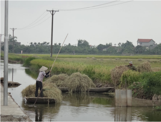
Figure 5. Using boat for delivery rice straw in wet season and transportation mean in the case of flood in Quoc Tuan (Photo taken 20th June 2016) [Colour figure can be viewed at wileyonlinelibrary.com ]

CCAs and move towards what other knowledges are available to local peoples who seek to further adapt to climate change within more-than-human communities.