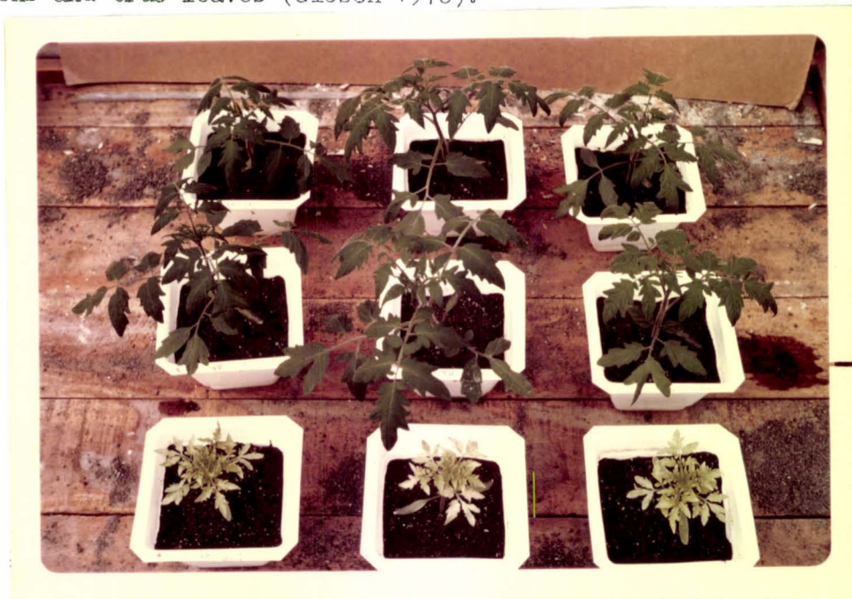
Plate 1. The general appearance of Potentate (top) Yellow seedling (bottom) and their F 1 hybrid (middle).

The selection was carried on over some 5 generations by Mr. Giesen until 2 lines ( L_1 and L_2 ) of commercial value were obtained. From these two TMV - tolerant lines, "Hira" and "Maia" were eventually obtained. Both lines produce up to 25% of "yellow" (= "netted virescent") seedlings which are slow-growing and possess comparatively small narrow and pointed pale green cotyledons and true leaves (Giesen 1970).