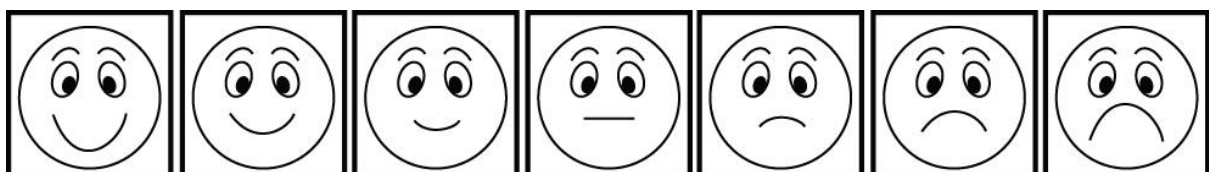
Figure 1. Response scale for the SFPS.

A pen and paper dental anxiety measure was used to measure discriminant validity of the MBDS with respect to dental anxiety. We named this scale the Smiley Faces Paper Scale (SFPS). The SFPS asks participants how they would feel in the same four dental scenarios used in the MBDS. Participants responded by selecting one of seven faces for each scenario (see Figure 1). The SFPS was based on two computerised dental anxiety scales for which evidence of construct validity and reliability has previously been reported: the Smiley Faces Program (Buchanan, 2005) and the Smiley Faces Program Revised (Buchanan, 2010; Jones & Buchanan, 2010).