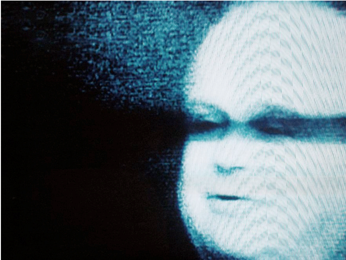
Fig. 5. Franz Suchomel in the DVD chapter The song of Treblinka. The station. The ramp. The role of the different command groups. The walk along the "funnel" to the gas chambers. The cold at Christmas.

In Shoah , the visual depicts the present while the voice evokes the past, and the tension of this juxtapositioning, creates and guides the fertile space for the viewer to imagine the realities narrated by the witnesses. Although this leads the informed viewer back to the usual suspects – visuals like those of the Resnais's film – at least Lanzmann recognizes, and skillfully plays with the limitations of his chosen media. This is a powerful strategy, of a somewhat allusive realism, as Florence Jacobowitz writes,