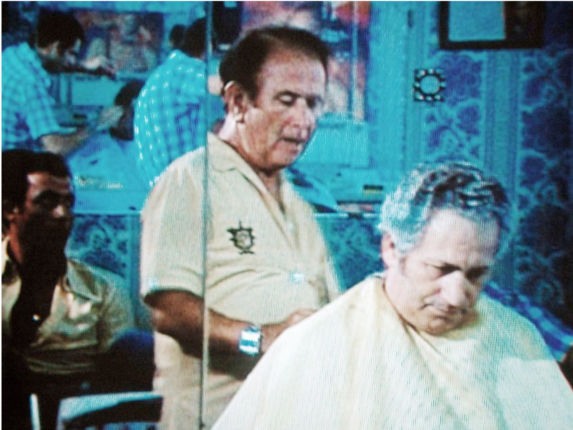
Fig. 4. Abraham Bomba talking in the DVD chapter Cutting the women's hair inside the gas chamber .

After this, Bomba wipes his eyes and tries to compose himself, and starts to talk so silently that it is very hard to hear what he is saying. Lanzmann's insistence on answers and painfully descriptive accounts is consistent through the film; his strategy of interrogating his interviewees perhaps reflects his frustration with the subject of the Holocaust. Interviews with the Germans who used to operate the camps are filmed in secret, and clearly without the consent of the interviewees (Fig. 5).