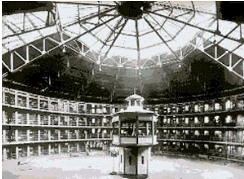
Interior view of panoptic cell house, new Illinois State Penitentiary at Stateville.

cannot verify when, or even if, they are being watched. As a consequence the prisoner should act as if under surveillance at all times. Foucault considers this the “machinery that assures dissymmetry, disequilibrium (and) difference” thereby reinforcing the power of the surveyor (1977:202). The panoptic is the “motif” of colonial power and is readily extrapolated to include the spatial surveillance and control of OPT towns, cities, camps and prisons (Zureik et al, 2011:8). This “matrix of control” under the guise of security is designed to virtually paralyze Palestinian lives through master plans of settlements, highways and bypass roads, army bases, closed military areas, nature preserves, internal checkpoints, zoning regulations, building permits, house demolitions and an array of other restrictions (Halper, 2011:1). 23