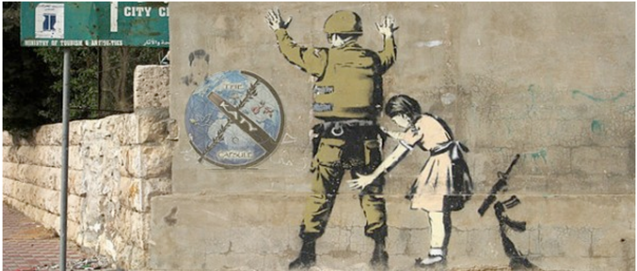
Banksy on the Separation Wall (2012) 174

“...power is not exercised simply as an obligation or a prohibition on those who do not have it; it invests them, is transmitted by them and through them; it exerts pressure upon them, just as they themselves, in their struggle against it, resist the grip it has on them.”