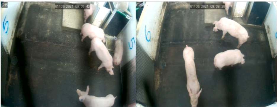
Fig. 2. Camera view of the feeding and activity area of the pens. Note: P value for effect of diet on exploring enrichment material = 0.082