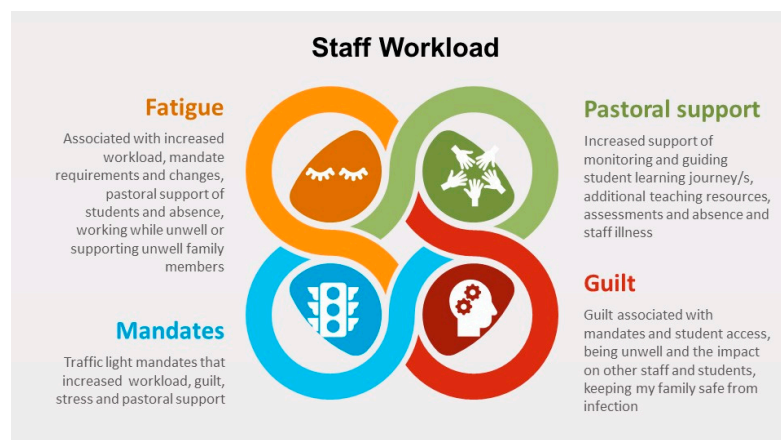
Figure 1. The impacts of the Omicron traffic light setting and staff workloads.

The connections between the mandates, pastoral support, guilt, and fatigue that were related to staffing workloads were complex and interwoven; Figure 1 displays these connections.