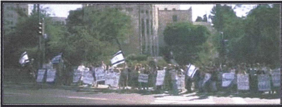
Figure 4: A Meretz protest against haredi efforts to close Bar Ilan St.

A: Yeah... I got arrested. They sent me to the police station... I sat and... I said that I didn't know why I'm there, I didn't do anything... they wanted me to say something in writing... They want me to say that I won't be there for one month on Saturday. So I didn't agree, I said "I didn't do anything, why, and if you want me not to be there take me to a judge and a judge will decide. You are... a police officer you are not to decide"... and he told me "OK, we're taking you to a judge" and trying to... make me threats. And I... still didn't give it... to him.