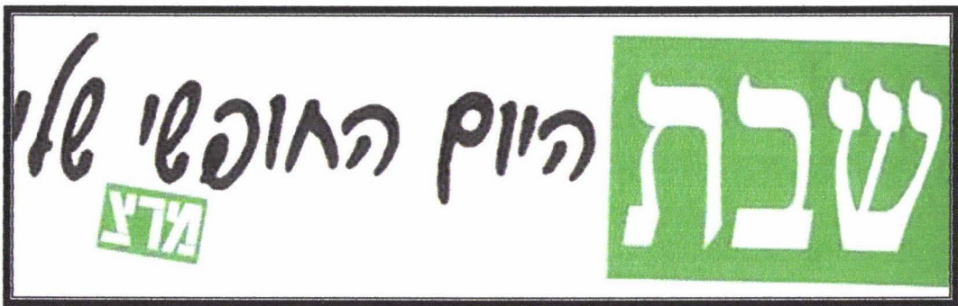
Figure 5: A bumper sticker: "Shabbat: My free day, Meretz"

avoided by the Jewish owner during the following weeks through his selling the store to his Arab employees for the Sabbath, then buying it back on Sundays. The failure of the store opening to stir up the predicted level of haredi opposition is an important sign of the weakening resolve of the religious sector in the face of a widespread disregard for laws demanding the closure of businesses on Saturdays. The secular parties were primed for a fight: I participated in a couple of Meretz demonstrations opposite the store to support the owner but there was little trouble, the worst violence being a brief scuffle outside between a haredi man and a Meretz activist which was snapped by a photographer and gained notoriety well beyond its actual import. I did not see a single religious counter-demonstrator at the rallies I attended.