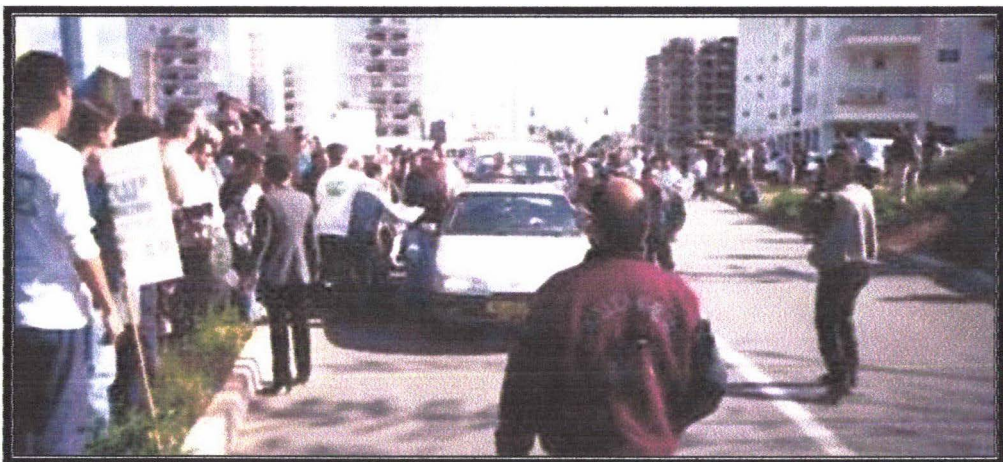
One protestor pulls another away from the car that tried to run over demonstrators at the Yovel rally