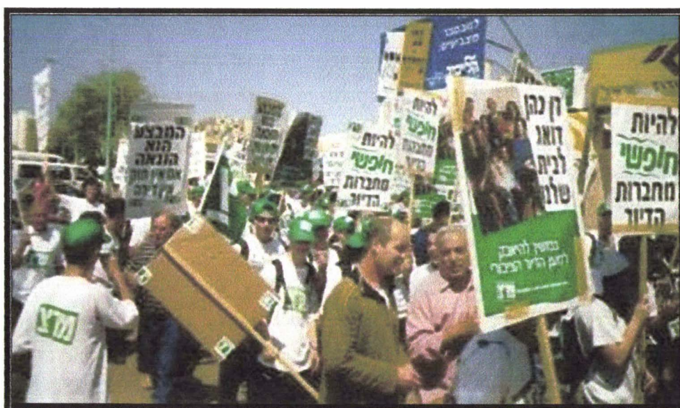
The Ashdod march gets underway

We held a rally in a public housing project in Ashdod attended largely by Meretz Noar and Tzerim , though I did see a number of locals holding Meretz signs and flags. The inhabitants of the neighbourhood, many of whom were ultra-Orthodox, watched distrustfully from their balconies as the Meretz MKs spoke in the square below. However the usual extreme animosity encountered in daily activism from Sephardim and right wingers was totally absent from this march and rally.