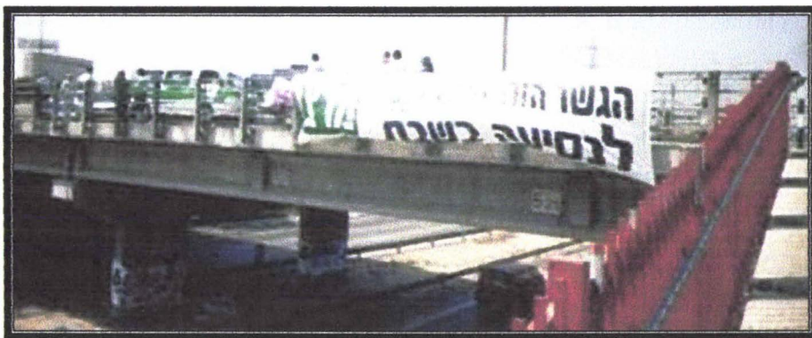
Figure 3: Meretz protesting haredi efforts to close a bridge leading into B'nei B'rak

Conflicts concerning the observance of the Shabbat are an intractable aspect of the Israeli kulturkampf , dating back to the Yishuv . The important feature of these conflicts is not the longevity of Shabbat struggles but the trajectory these have taken in recent years with secular successes far outnumbering religious attempts to coerce observance. Public observance of the day of rest has been buckling under the twin onslaughts of commerce and the growing militancy of the secular public and their desire for shopping and entertainment on their only full day off work. It is this typically middle class concern with lifestyle rather than any ideological or political motive that has seen the progressive rolling back of business closures in Jewish areas.