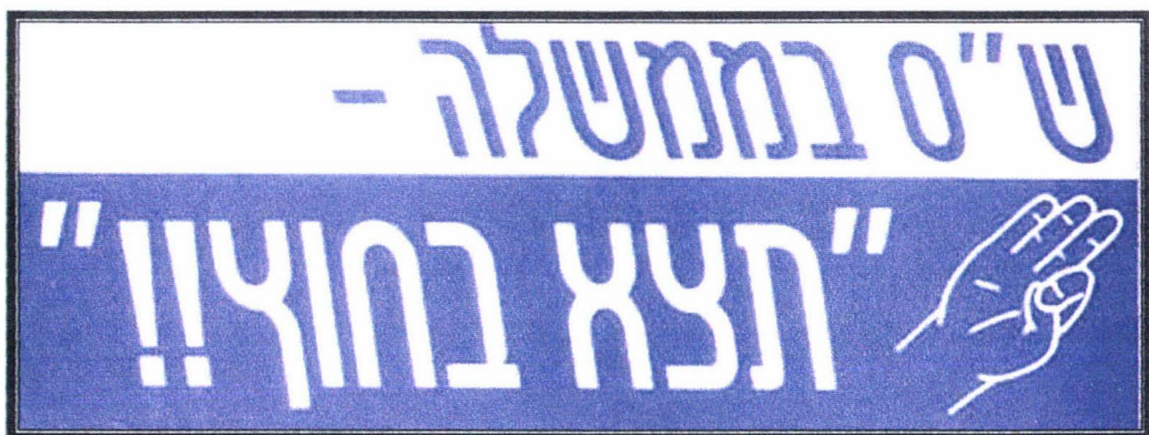
Figure 16: Anti-Shas sticker from post-election 1999 showing Shas hand sign. "Shas in the Government, Get him out" (aping words of Ovadia Yosef targeted at a secular journalist).

We sang the above ditty - a take-off of a Passover song - in various forms at demonstrations against Shas. It refers both to Shas' Mayan education system, and to the party's leader Aryeh Deri and the jacuzzi he bought with money garnered through bribe-taking. Shas supporter's use a three-fingered hand-sign with the forefinger and thumb meeting to form the letter shin in Shas in showing their support for the party. We aped this by holding up four fingers at anti-Shas demonstrations shouting in English, "Four more years" in reference to the four years jail Deri had just been sentenced to for fraud and bribe taking.