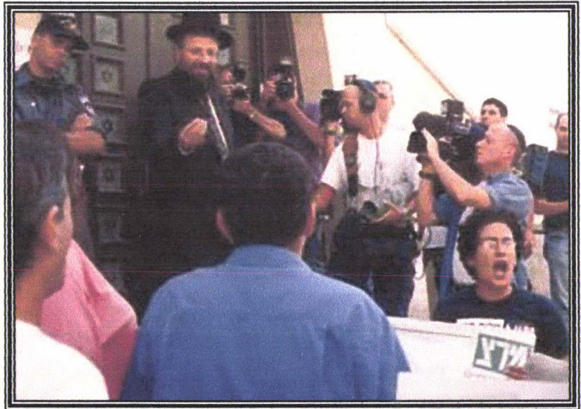
Figure 9: Meretz & Peace Now protest at a Tel Aviv meeting of haredi and settler rabbis hosted by Chabad

However a loose political and identity coalition between the two movements does exist and should be acknowledged insofar as it impacts on this dissertation, and the