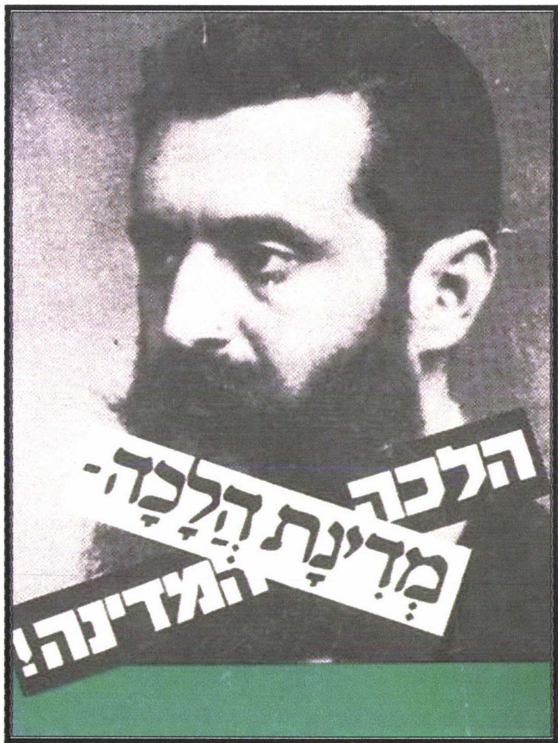
Figure 1: A RATZ sticker with Herzl in the background: "A Halakhic State- The State is Gone!"

Israeli society is deeply divided along religious-secular lines in a manner characteristic of kulturkampf . This dissertation discusses the role of the Meretz political party in this struggle, building on ethnographic research carried out with the youth sections of the party in 1999 and 2000 and subsequent peace activism. The history and nature of the Jewish kulturkampf are charted and described, as is the development of the secular Jewish identity community. Interview excerpts are used to elucidate the understandings and experience of culture war and Jewish identification from the standpoint of committed secular activists. Finally, predictions are made for the future trajectory of the kulturkampf .