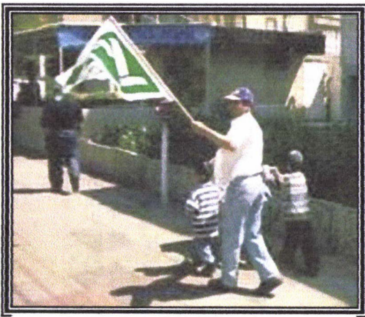
An Ashdod Sephardi housing tenant waves the Meretz flag