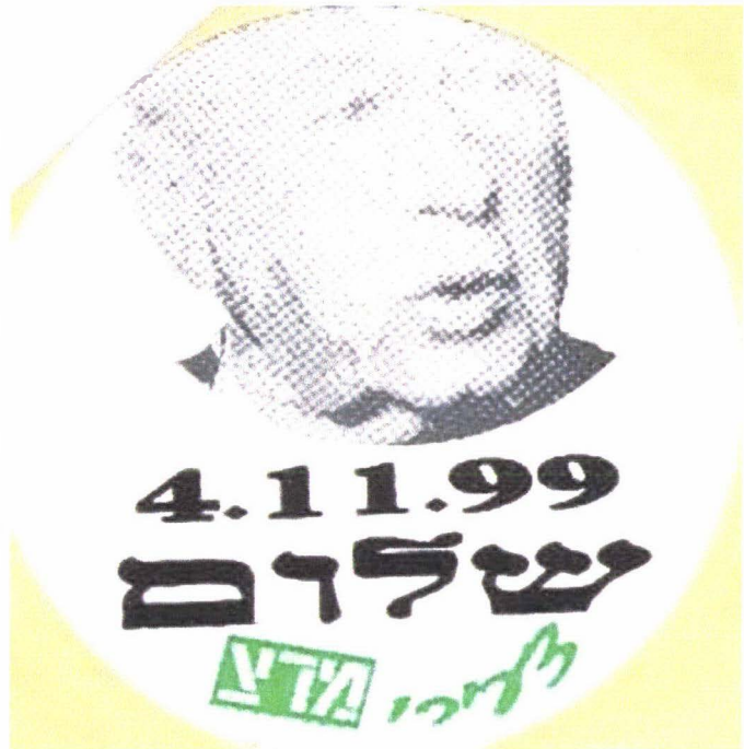
Figure 10: Tzerie Meretz Rabin Day Sticker, "Peace"

The assassination of Rabin presented the Labour-Ashkenazi elite with a unique opportunity to re-establish their political power after many decades of decline and ideological sterility. Lacking any real unifying identity Labour and Meretz had hitched themselves - with varying degrees of commitment on Labour's part - to the peace process as their primary 'flag'. In a situation where the New