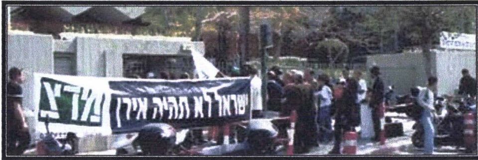
Figure 8: "Israel will not become Iran"

will not become Iran' and basically putting on a show of strength that prevented all but a couple of students from laying tefillin as intended by the Chabadnikim.