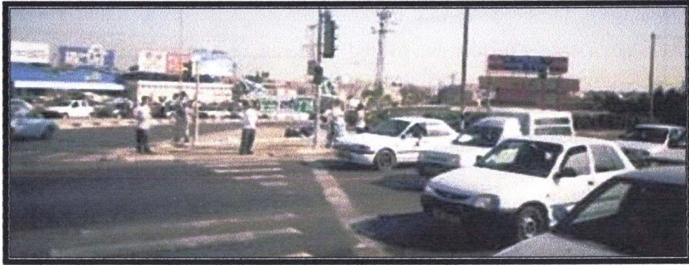
Figure 2: A typical intersection

I was unable to write fieldnotes every day as the preparation of election ephemera, travel, the setting up of almost daily demonstrations, 'intersections' 5 , college elections and student days, and other street activities took up most waking hours with sleep snatched in between.