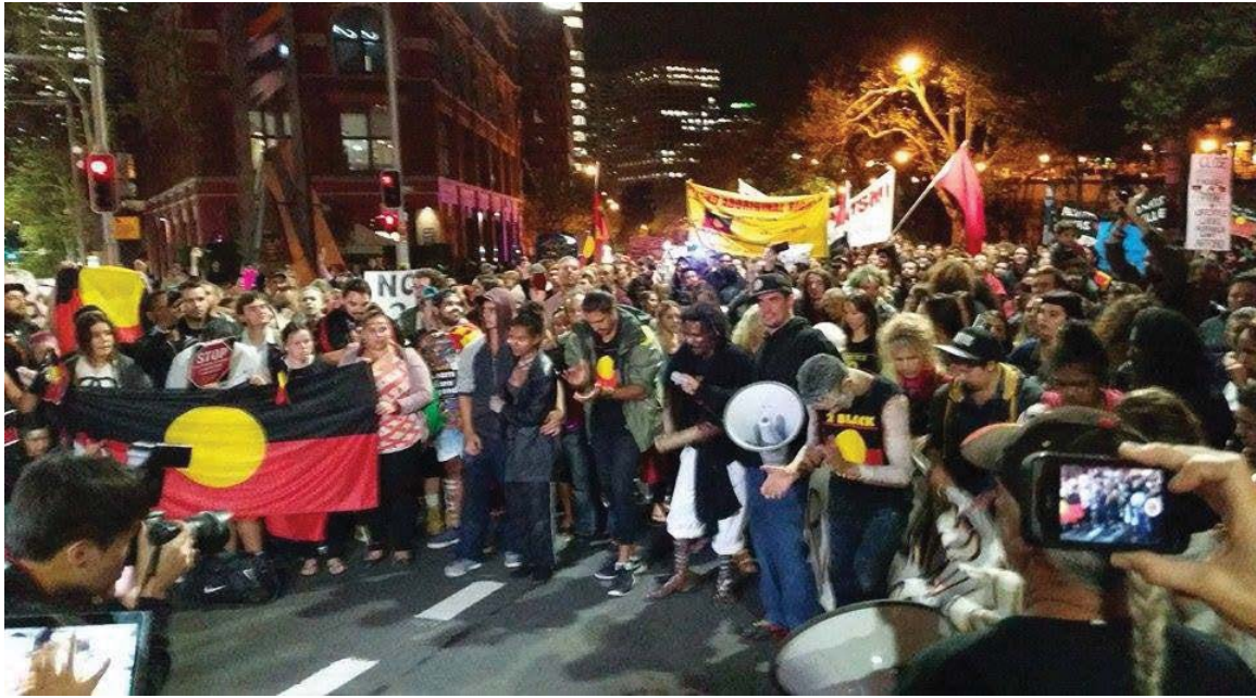
Figure 9: Melbourne Protest. Image: Amy Thomas. (McQuire, 2015a)