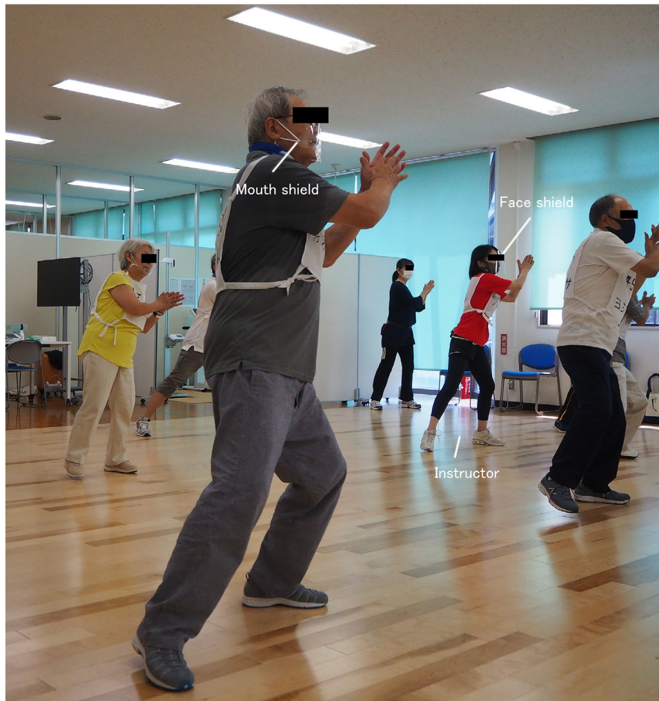
FIGURE 2 A J-MINT instructor wears a face mask and a face shield for infection control, while participants wear a mask or a face shield. Instructors and participants are exercising with physical distancing. J-MINT, Japan-Multimodal Intervention Trial for Prevention of Dementia

were restarted in July 2020, with intervention delivery shifting from in-person meetings to use of video conferencing technology.