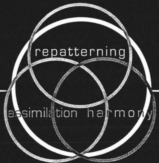
f i g u r e 4

b e c o m i n g b e t t e r b u t d i f f e r e n t