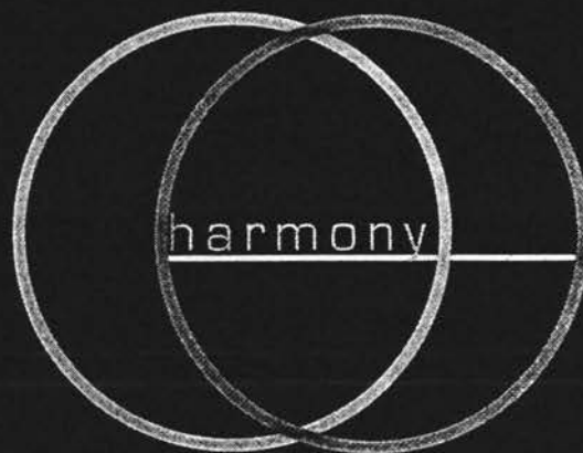
f i g u r e 2

b e c o m i n g b e t t e r b u t d i f f e r e n t