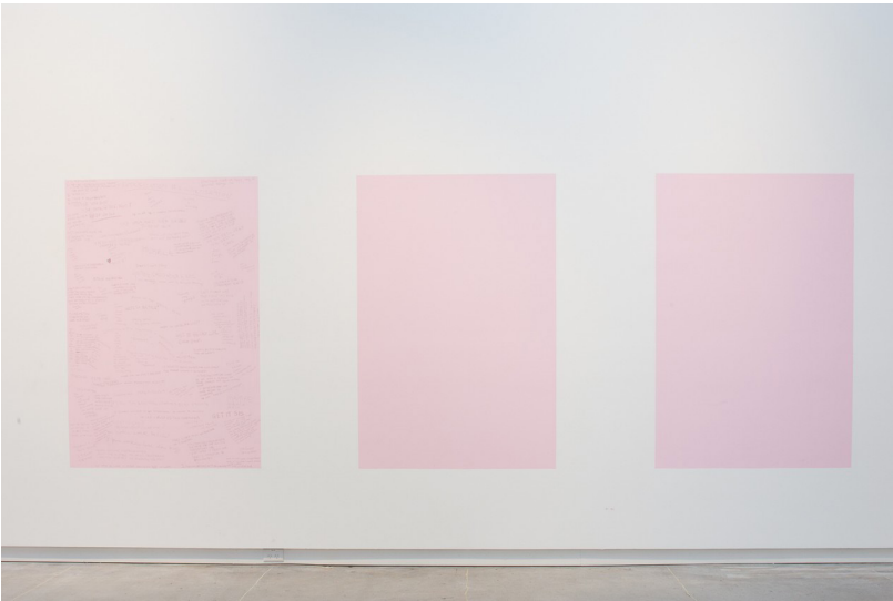
FIGURE TWO: Ephemeral text written on the gallery walls. Toi Moroki CoCA - 2017.

to educate Pākehā curators on ways they can work with indigenous artists without putting pressure on them to constantly make work that addresses “decolonisation”, because “despite the best efforts of contemporary Pākehā curators to decolonise spaces, what results is often a recurring tokenistic representation of the Indigenous body.” 30 We were, however, able to draw on and grow from this experience to ensure we are never put in this position again; it has also helped us figure out healthier ways for us to work with artists, so that they have more agency and feel better supported.