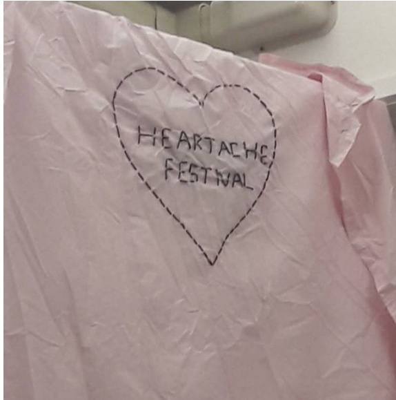
FIGURE SIX: A banner for Heartache Festival (March 2018)

Much of the research undertaken this year has been deeply informed by how to center love and care within my practice, which has been shaped by personal grief and the process of reading and re-reading bell hook's seminal book, All About Love: New Visions . 33 In this book hooks discusses a number of things, but the most poignant part for me was her discussion of the way we can come together through hope, because “[w]ithout hope, we cannot return to love.” 34 The idea of love, and the loss of love or the aching of love, came at a time when many people around me were hurting. I saw this as an opportunity for sharing space with others, to share and enact modes of hope and care for each other.