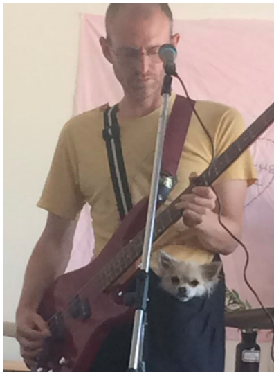
FIGURE EIGHT: The band Slow performing at Heartache Festival , March 2018