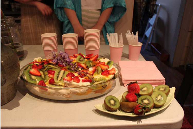
FIGURE ONE: Dreary Modern Life Launch (2015), Time Out Bookstore, Tāmaki Makaurau.