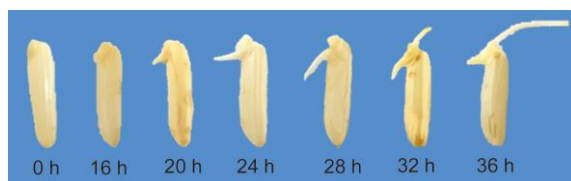
Fig. 2. Structural changes in rice grain (cultivar BRS Pampeira) during germination process at 30 °C and 80% relative humidity (Nonogaki et al, 2010).

These transformations result in changes in the nutritional and technological properties of the grains. Kamjijam et al (2020) demonstrated that the content of essential amino acids (alanine, arginine, glycine, methionine, proline, serine, tyrosine, tryptophan and valine) in rice grains increases with germination and reaches maximum levels between 72 and 96 h. Chaijan and Panpipat (2020) studied on the feasibility of obtaining a germinated extract of Thai indigenous rice, and observed a substantial increase in GABA content during germination (35 °C, in the dark) between the 36th and 48th hour, increasing from approximately 1.5 to 55.0 mg/kg, a value that did not change until the end of the process (96 h). On the other hand, Singh et al (2017) reported that the lipid content in the flours of germinated cereals decreases