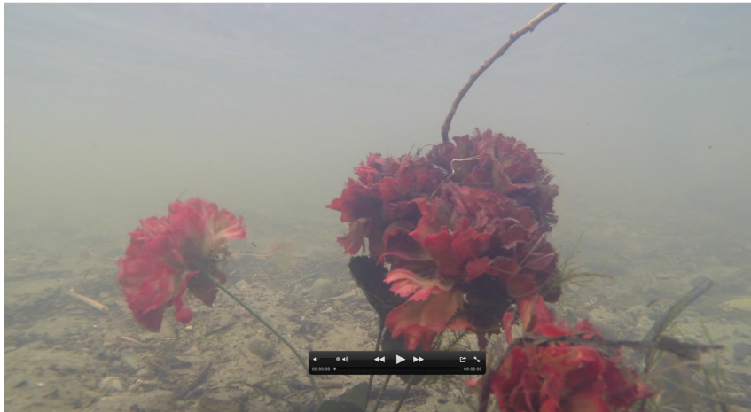
Fig 14, # 14 Stepping In / video still, image by author (2014)