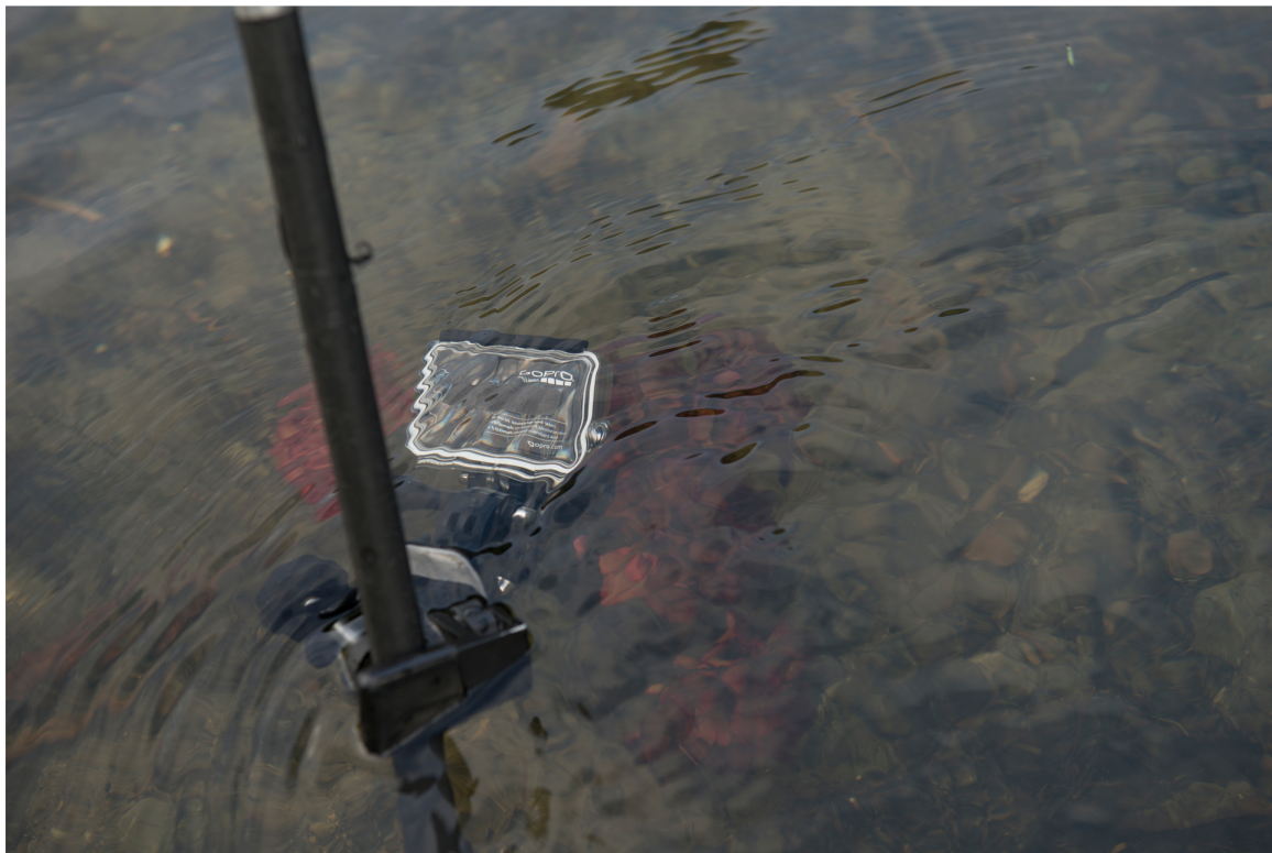
Fig 10, Underwater Gopro, production still, image by author (2014)