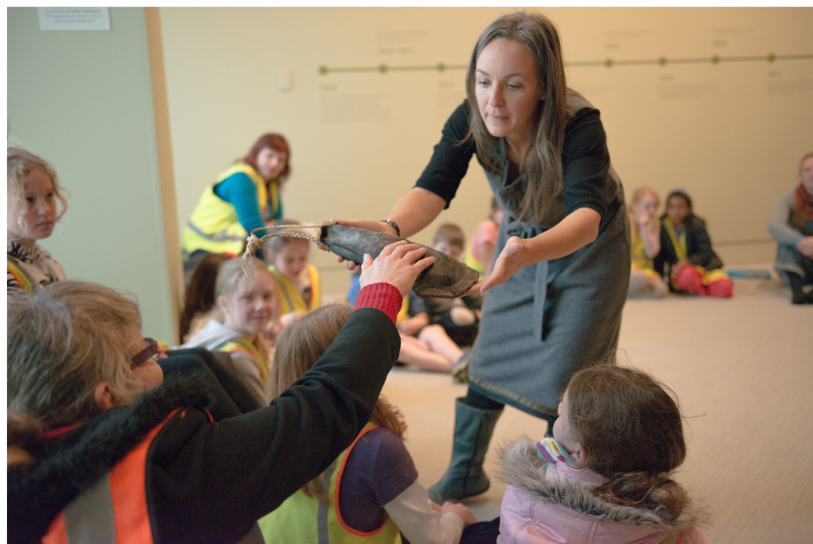
Fig 12, School children learn about traditional Māori fresh water vessel, image by author (2014)