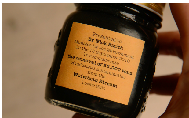
Fig 9, Bottle of 'Black Ooze presented to Nick Smith, image by author (2014)