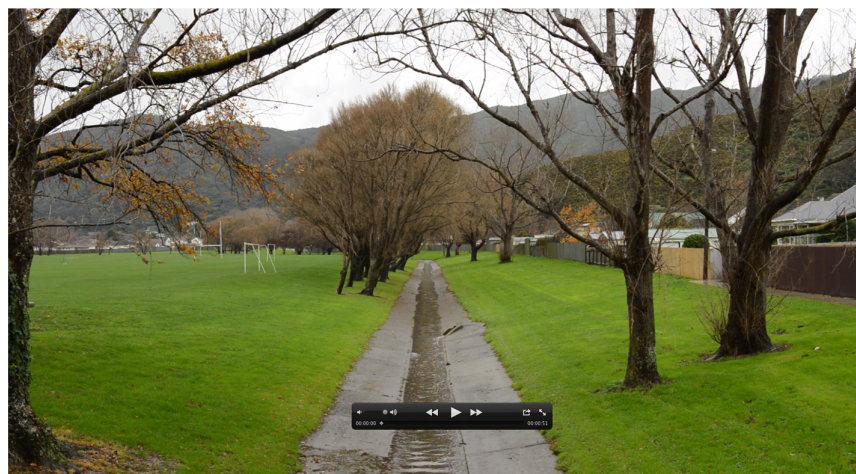
Fig 18, # 10 Stepping In / video still, image by author (2014)