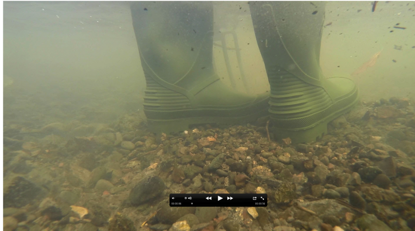
Fig 13, # 08 Stepping In / video still, image by author (2014)