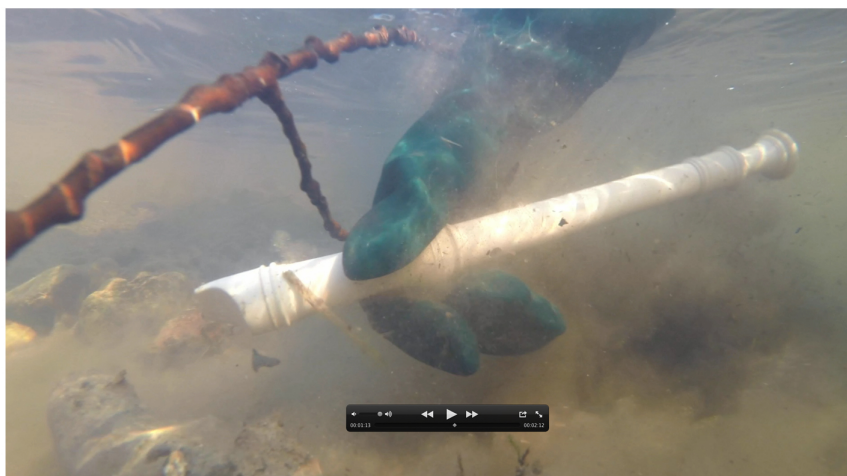
Fig 15, # 07 Stepping In / video still (2014)