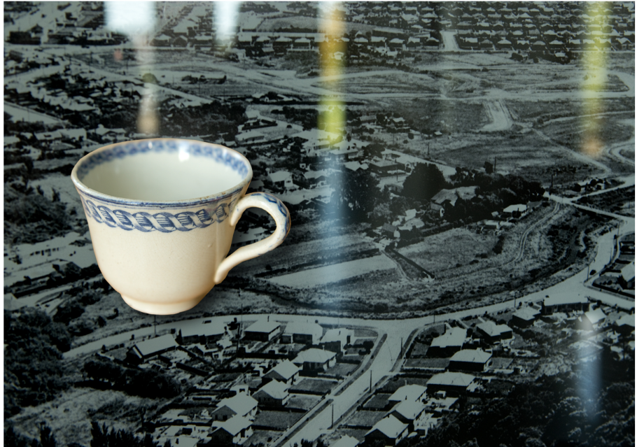
Fig 2, Teri Puketapu's cup, against early aerial photograph of Waiwhetu settlement, image by author (2014)