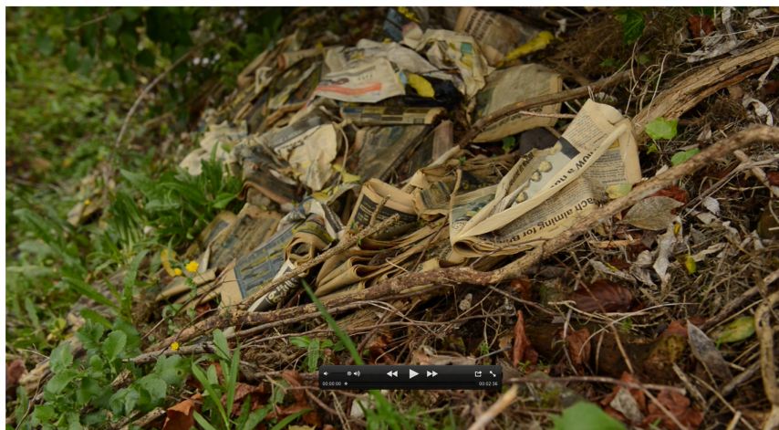
Fig 17, # 06 Stepping In / video still, image by author (2014)