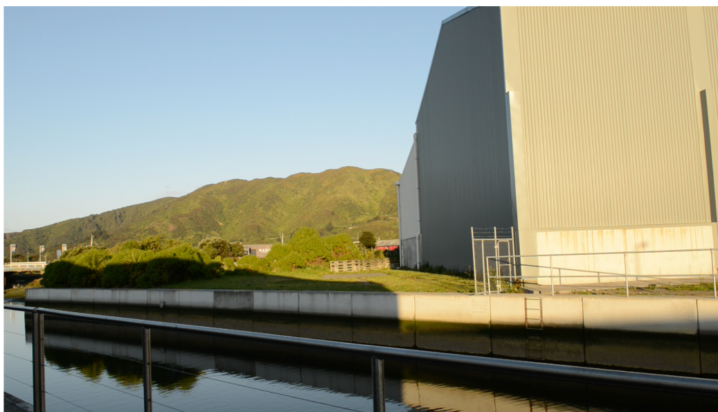
Fig 8, Concreted in stream head, Seaview (2014)