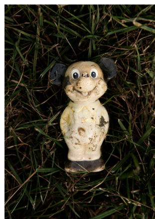
Fig 5, Mickey Toy , image by author (2014)