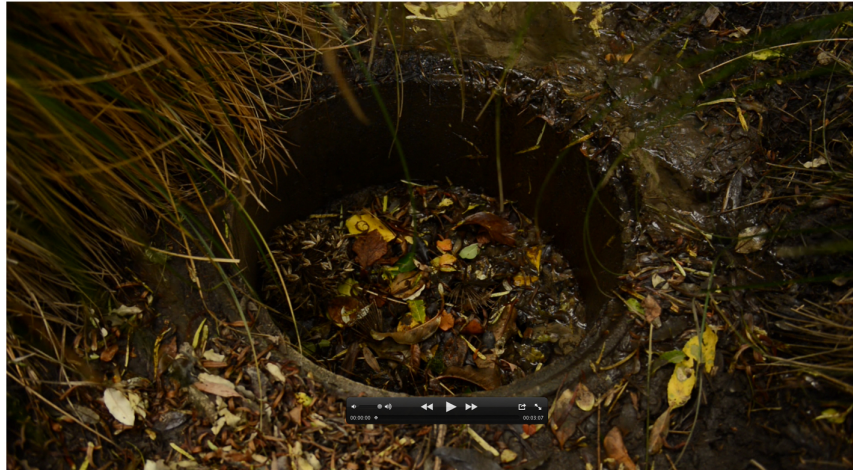
Fig 16, # 29 Stepping In / video still, image by author (2014)