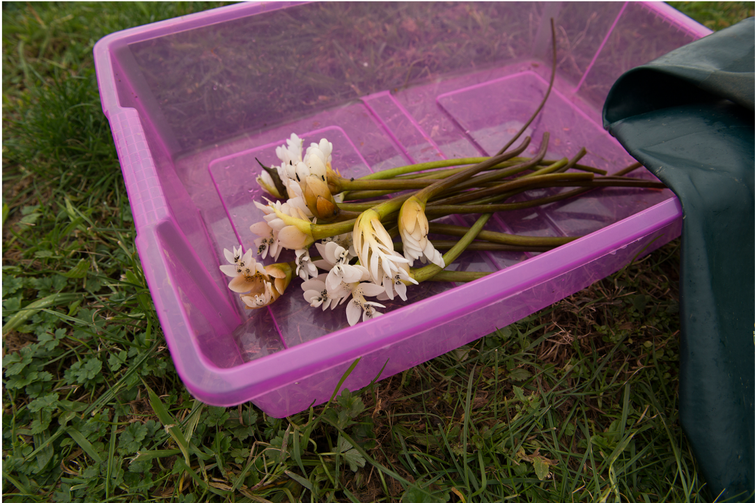
Fig 6, Collecting Cape pond weed flowers (2014)