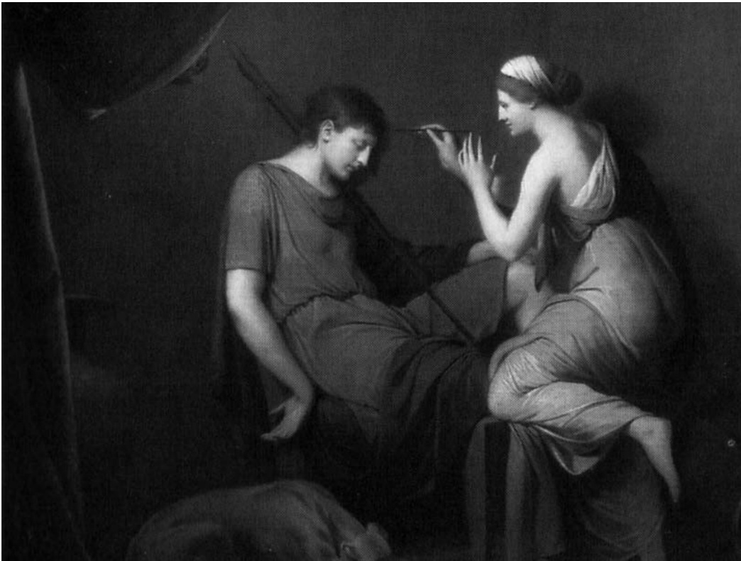
(Fig. 2). Joseph Wright of Derby. The Corinthian Maid . (1782-1784).

'Thus from thy power, inspiring LOVE, we trace. The modell'd image, and the pencil'd face.' 2