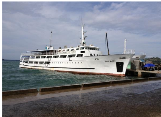
Figure 3.4: Local ferry boat serving between Honiara and western ports to Gizo.