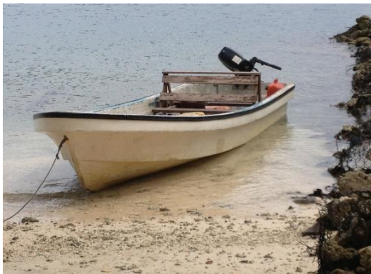
Figure 3.3: 15 horse-powered ray boat being used to collect data in Choiseul Islands (photo by Tozen Leokana, 2013).