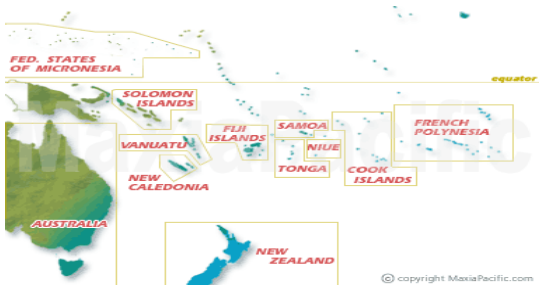
Figure 1.1 The location of the Solomon Islands in the South Pacific region.