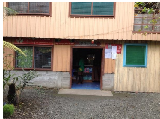
Figure 3.6: Typical business set-up operating under the owner's house