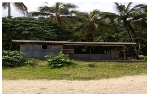
Figure 3.7: A run-down community-based building usually housed the community trading business