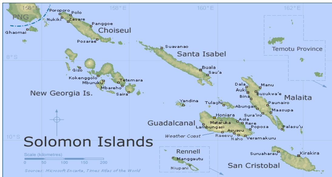
Figure 1.2 Map of Solomon Islands