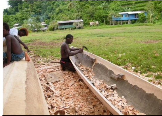
Figure 3.2. Canoe making - one of the sources of income-generating activity males engaged in to earn cash in Choiseul.