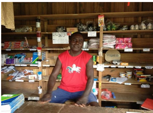
Figure 3.5: A businessman attending to his family-owned trading business