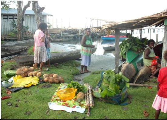
Figure 3.1. Showing women selling local produce from their garden.