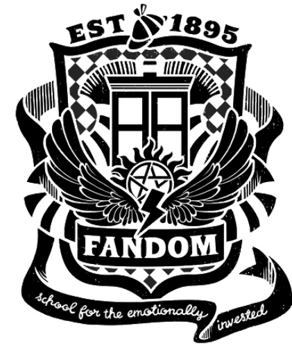
Fig. 1 : An Example of fan art meta