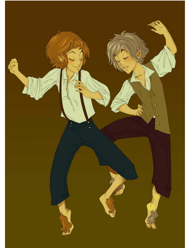
Fig. 2 : An Example of cartoon-style fan art

Finally, I thank my partner, Paul Tobin, without whom there wouldn't have been a square one.