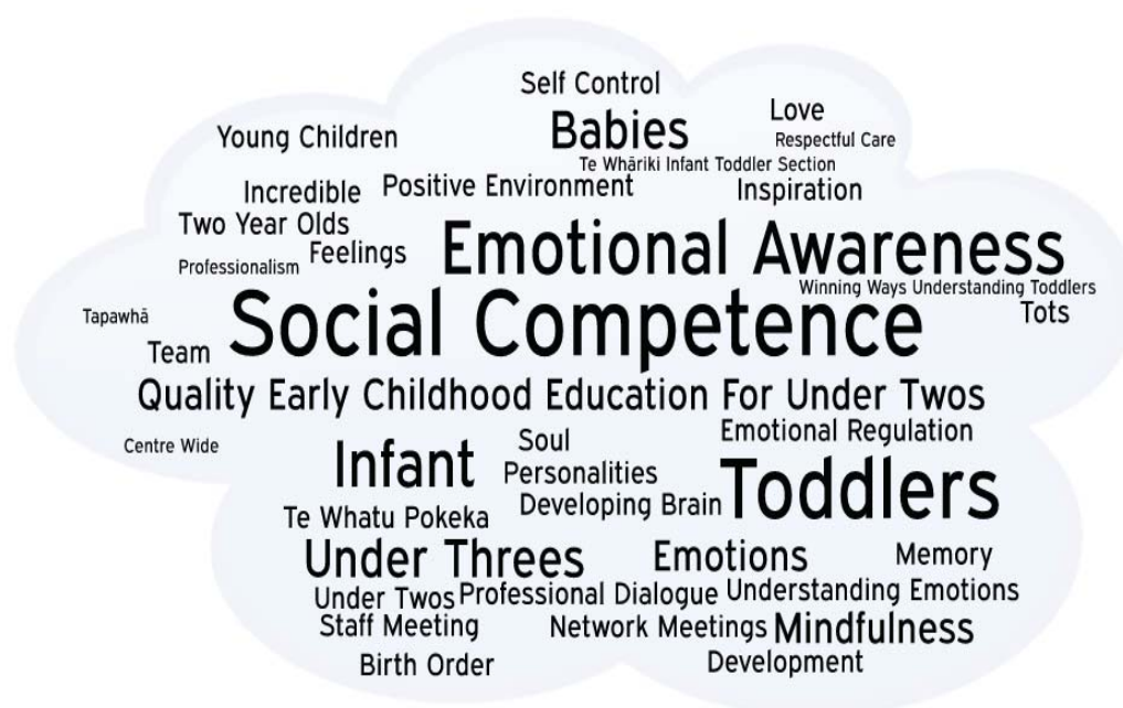
Figure 2. Key words and phrases from teachers' professional learning.

Professional learning and reading that had specifically supported teachers' work with toddlers, within the context of peer conflicts, was identified through the questionnaire, focus group interviews and background information provided by each early learning setting. All of this information was collated and analysed to identify key words and phrases and their frequency. These key words and phrases were analysed using Tagul ( https://tagul.com/ ), an online word-cloud generator. The word cloud is displayed in Figure 2, with the most frequent words or phrases in larger text.