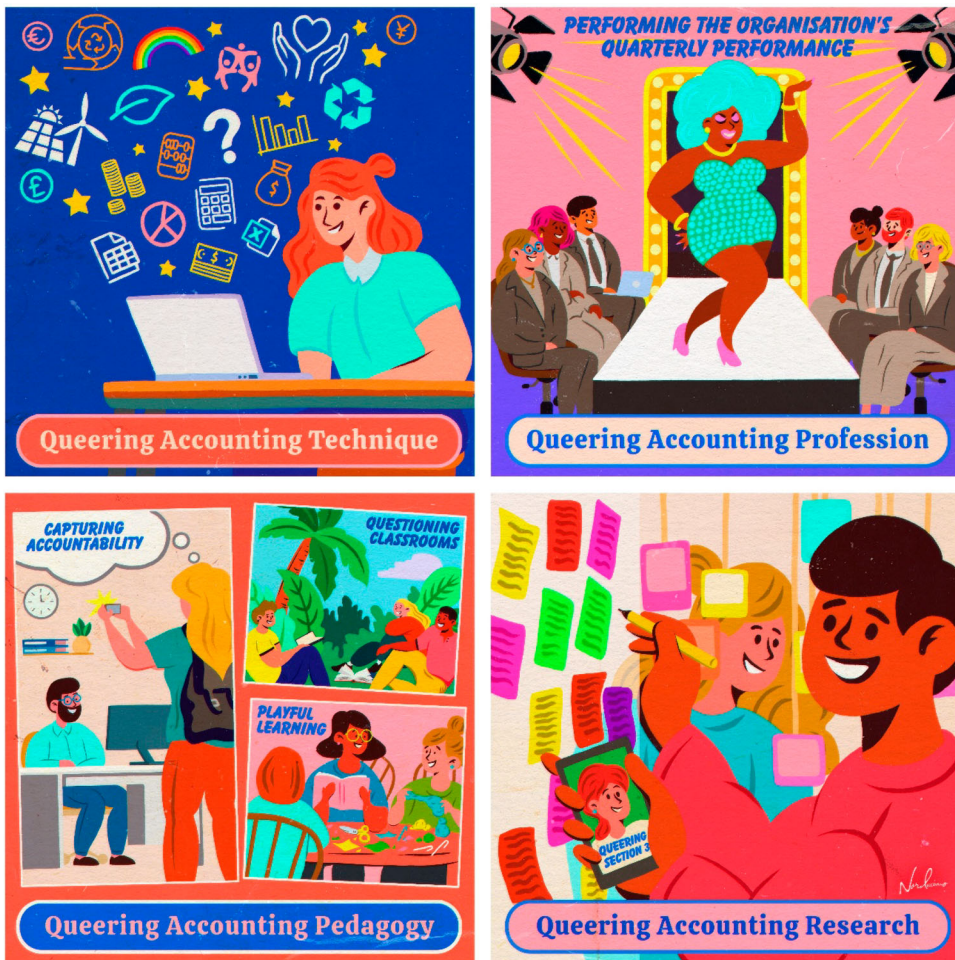
Figure 1. Queering accounting sites.

doing so, we see the limitations in numbers and advocate for new and creative ways of representing diverse realities. In queering the accounting profession, we encourage accounting professionals to be open to diverse perspectives, new ways of engaging and humanistic ways of being professional. Calling for an opening up and connectedness across the profession that fosters greater diversity and a more holistic, integrated mindset. In queering accounting pedagogy, we shine a light on the hidden curriculum to provide opportunities for challenging heteronormative discourse. We advocate for the queering of pedagogical techniques to envisage new ways of learning and to reimagine the nature of accounting classrooms. In doing so, we call for the opening of space in accounting education for all voices to be heard. Through queering accounting research, we urge researchers to engage with queer voices and identities in accounting. We further call for the queering of research practice, opening up accounting research to queer methodologies and non-normative research frameworks and forms of dissemination. Figure 1 provides a visual representation of the multiple accounting sites we call to queer.