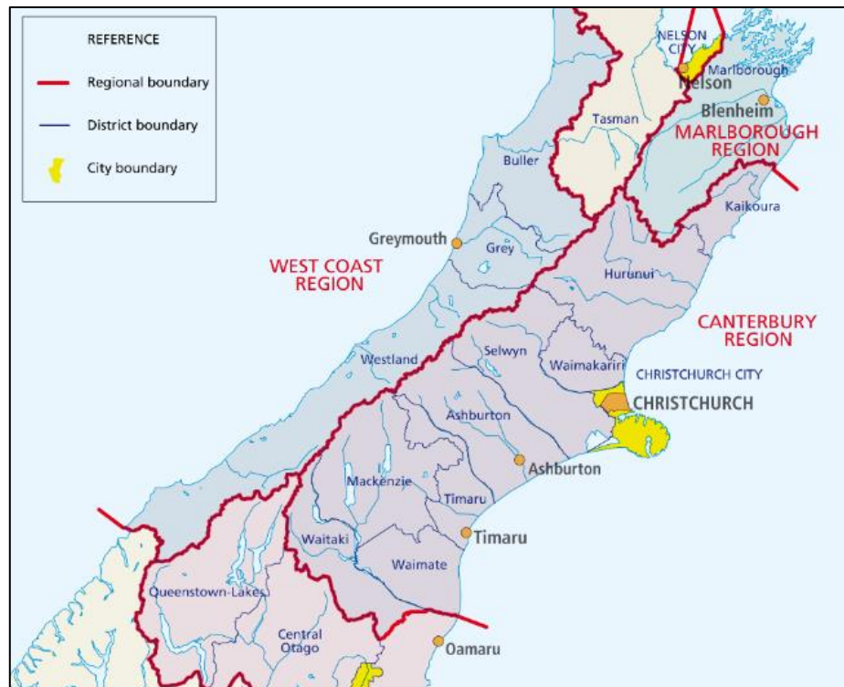
Figure 4.2 - Map showing Regional and District Boundaries (Local Government New Zealand, 2017).

emergency ended shortly after on the 9 th December 2016 after being extended due to ongoing difficulties.