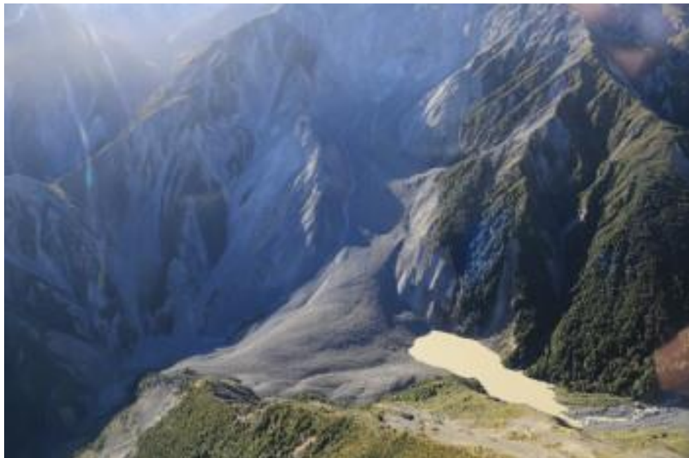
Figure 1.6 - Hapuku River landslide dam (GeoNet, 2016).