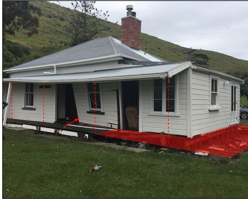
Figure 1.13 - Tsunami damage to the cottage at Little Pigeon Bay. The red area and lines are where the veranda and poles were (GeoNet, n.d).