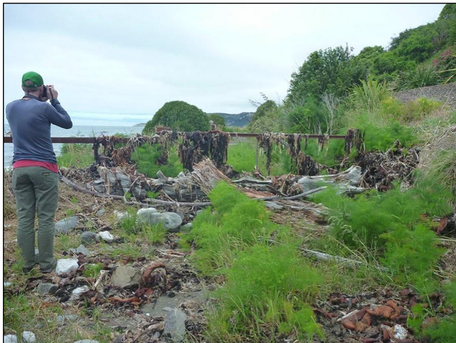
Figure 1.12 - Seaweed left high and dry by the tsunami at Oaro.

Several of the faults to rupture were submarine faults and the movement of the sea floor generated a tsunami along the east coast. This was unusual due to the epicentre being on land. The tsunami waves arrived only 10 minutes after the earthquake in Goose Bay south of Kaikoura with a 6.9m run-up recorded, and it travelled over 200m up the Te Moto Moto stream in Oaro as can be seen in Figure 1.12 from the debris left behind (GeoNet, n.d).