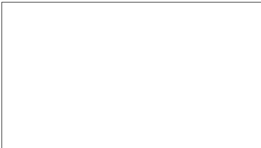
Figure 1.11 - An aerial shot of Kaikoura's uplifted coast and seabed (BBC News, 2016).