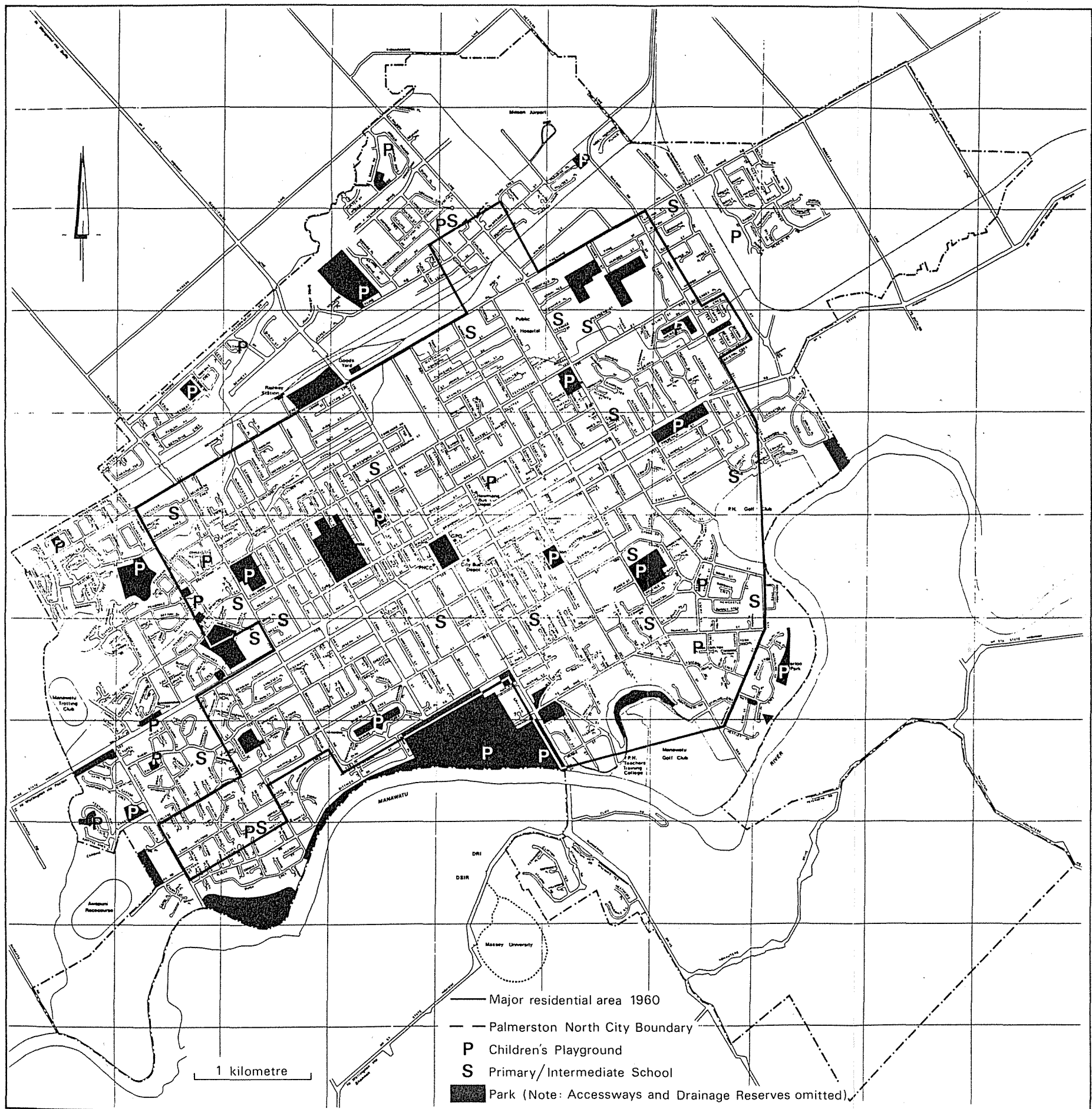
Fig. 2-3 Playground, Park and Primary School Locations - 1982, Palmerston North