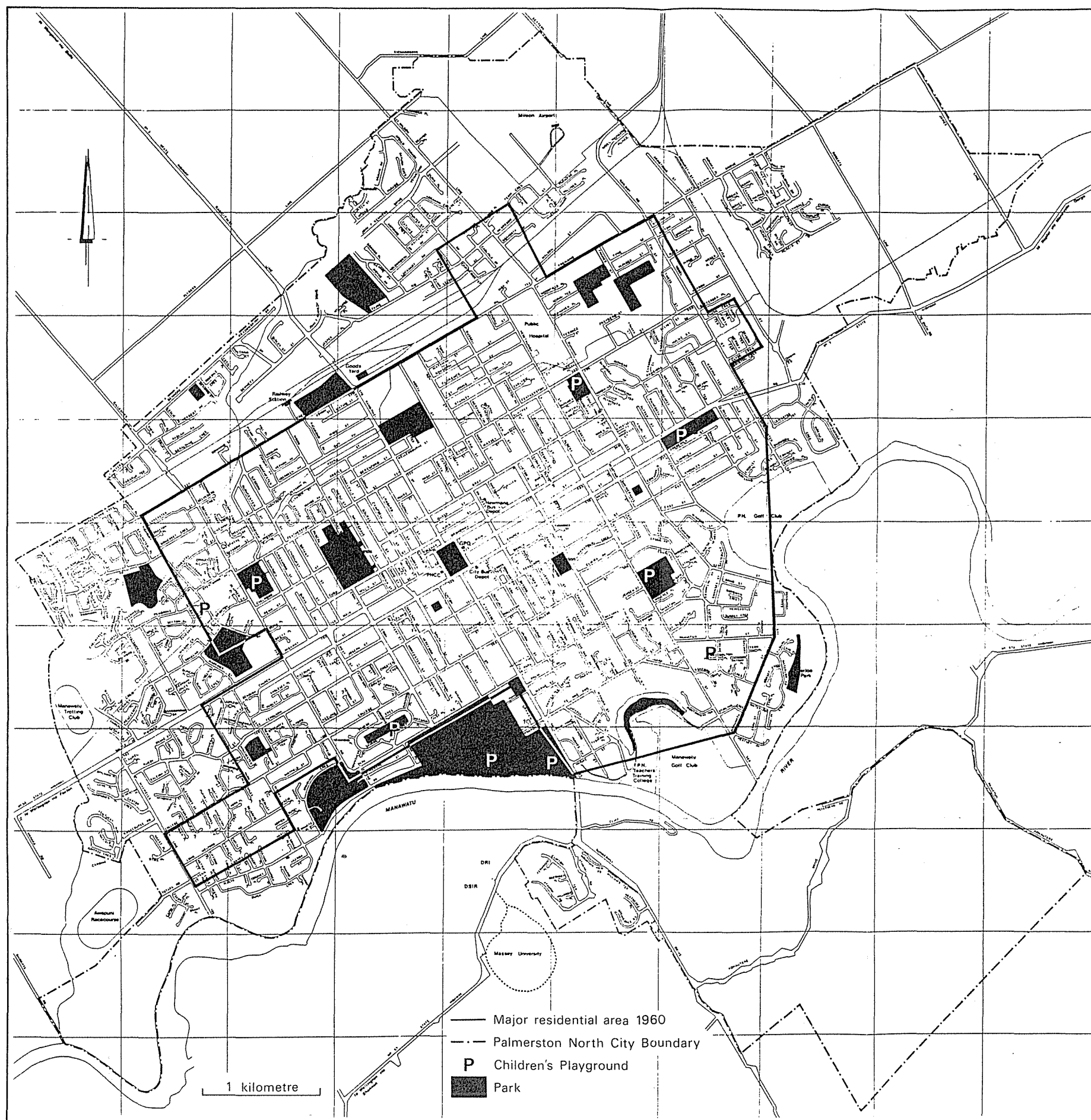
Fig. 2-2 Playground and Park Locations - 1960, Palmerston North