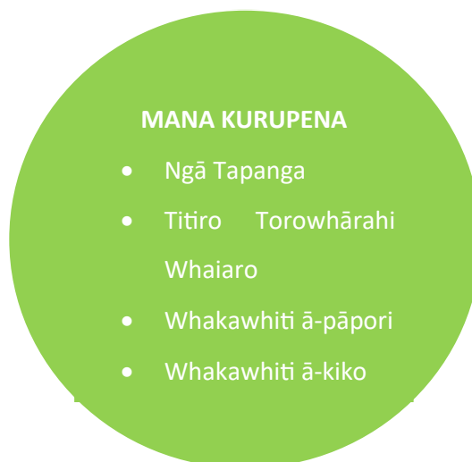
Ata 6 Ngā Kaupapa Tāhū o te Mana Kurupena

Ka taka ki runga i a tātou katoa ngā momo tapanga. Ko aua tapanga rā he mea taka mai i te whānau, i te hapū, i te pāpori, i te tauhou, i a koe tonu, i a wai kē ake rānei. Ko ngā tapanga pāpori he tapanga ka taka ki runga i te tangata i runga anō i tōna kāwai whakapapa, tōna ngaiotanga, tōna kaumātuatanga, tōna aronga hōkaka, tōna papapori, tae atu hoki ki tōna ira.