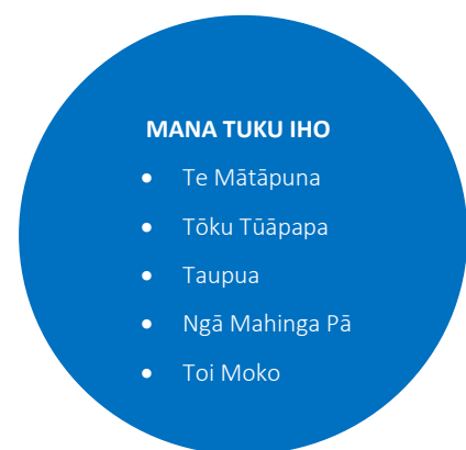
Ata 4 Ngā Kaupapa Tāhū o te Mana Tuku Iho