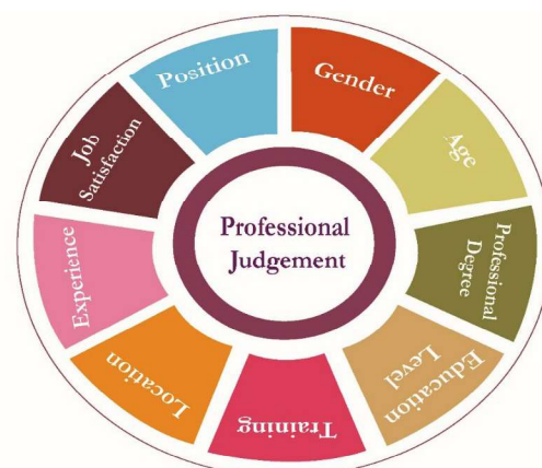
Auditor attributes and professional judgement

However, based on the above literature and hypothesis, a theoretical framework is drawn with all the professional auditor judgment attributes. Figure 2 presents the framework of auditor attributes and professional judgment.