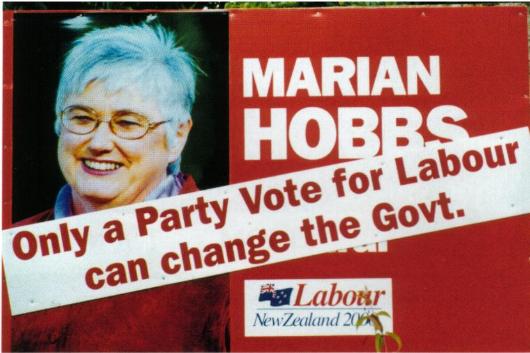
Figure 2 Billboards in Wellington Central

Top: An example of the type of Labour's billboard slogan that concerned the Alliance campaign team.