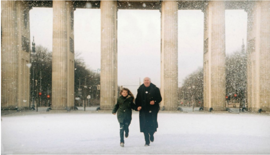
Fig. 4 Screenshot of the ending of The Dust of Time