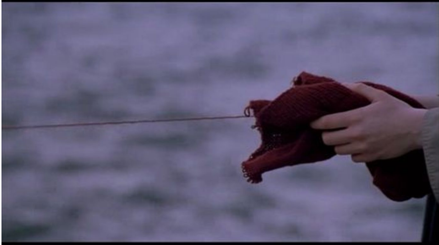
Fig. 1 Screenshot of the farewell scene from The Weeping Meadow

the body of his twin brother lies in a forbidden zone, because he fought for the Left. The theme of two brothers fighting each other to the death references the story of Eteocles and Polynices depicted in Greek Tragedy in Aeschylus' The Seven Against Thebes (467 BCE). 43 Their sister Antigone famously disobeyed Creon's edict and buried her brother even though he fought against his city as depicted in Sophocles' Antigone (c. 441 BCE). Angelopoulos' Eleni follows in the footsteps of this tragic heroine by going in search of the body of the second twin, the one she is encouraged by the state authorities to forget.