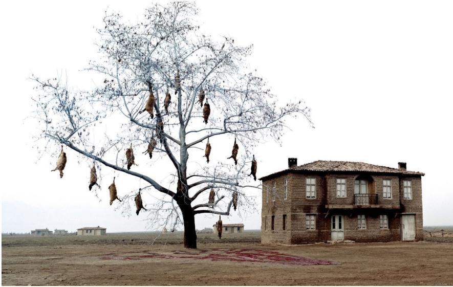
Fig. 3 Screenshot of the blood sacrifice in The Weeping Meadow

(Bach and Tchaikovsky), to modern pop and rock music (Bowie, the Doors). The later are the younger Eleni's musical choices which clash with those of the older generation. The clash of generations is thus played out on the aural plane, too. The importance of music is demonstrated in a key scene when a piano tuner is asked to repair an old organ in the camp, but it proves unnecessary. Wonderful music pours out lightening the burdens of Eleni and Jacob, albeit briefly. Music and art in general endure even in a labour camp in Siberia or among the communities of Asia Minor refugees. Art can temporarily trump political ideology, but as in the earlier film this state of affairs never lasts.