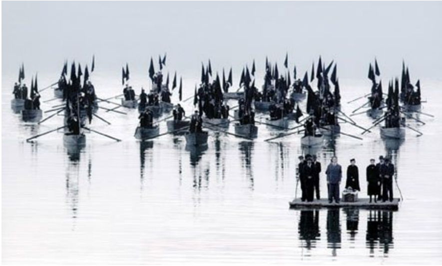
Fig. 2 Screenshot of the funeral on the river, The Weeping Meadow