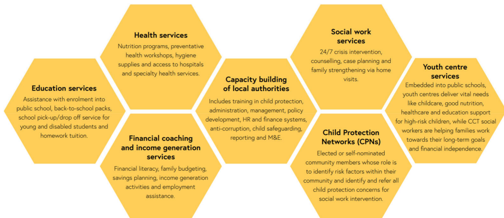
Figure 1. CCT holistic approach to services enabled within the Village Hive model.

first orphanage in Cambodia to transition from orphanage to a family-based care approach which evolved into the “Village Hive” model (more below).