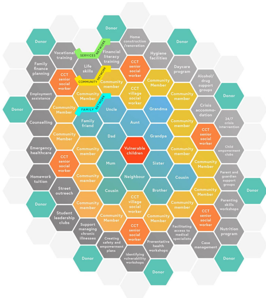
Figure 2. CCT’s vision of a self-contained Village Hive approach centred on vulnerable children within empowered family, community and services networks, and strengthened by CCT staff and donor support in its establishment phase (see CCT, 2020).

being separated from their families and reunited hundreds of children in orphanages with their families. Figures 1 and 2 indicate the holistic approach of the Village Hive model, embedding needed services within the community to be integrated under local governance rather than separate NGO authority. Appendix C outlines the Ou Char pilot of the Village Hive model and shows the embedded, inclusive, collaborative approach. Appendix D highlights the main programmes of CCT presented chronologically demonstrating the evolutionary change of its programmes from a “downstream” child rescue approach to an “upstream” community empowerment approach.