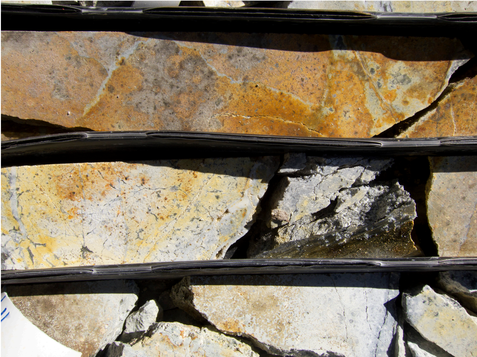
Core samples, New Zealand Petroleum and Minerals Core Store.