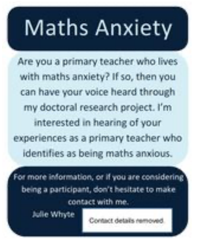
Figure 3.2 A subsequent Facebook post.

these posts, as the information contained therein may have been too profuse for individuals to consider at first contact. These subsequent posts, as seen in Figure 3-2, gained greater Facebook 'traffic', along with private message contact. After this contact and 'chatting' about the study, the research information sheet was then provided to those who had made the decision to be a participant or to those who required further information prior to making a participation decision.