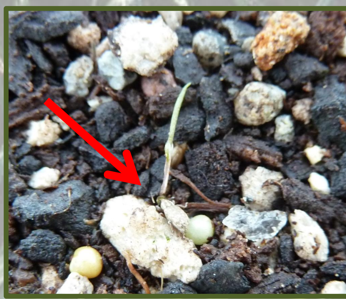
Fig. 1: Adult Argentine stem weevil feeding on the base of a developing perennial ryegrass seedling infected with a known peramine producing endophyte strain.