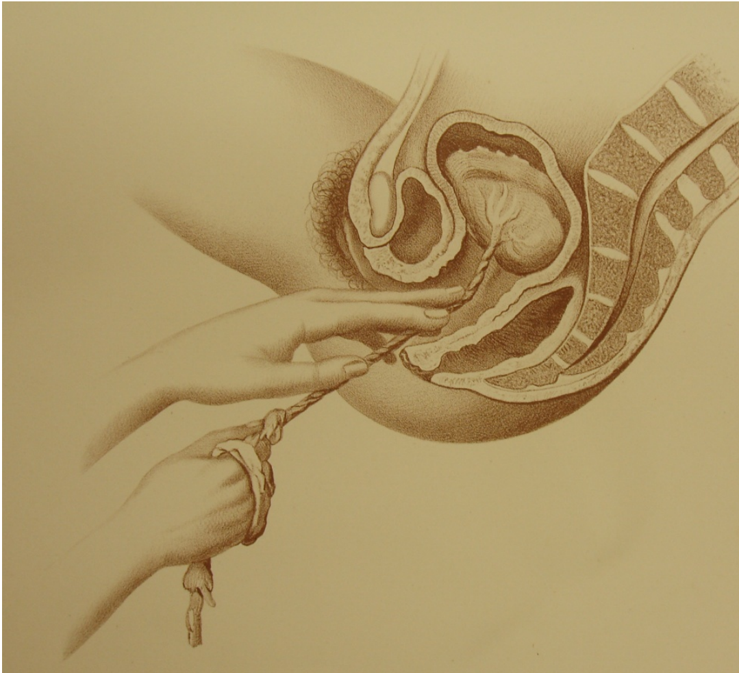
Figure 3: Illustration (woodcut) of cord traction from F. Getchell's Illustrated Encyclopaedia of the Science and Practice of Obstetrics , Gebbie, Philadelphia, 1890, plate XXXV11.