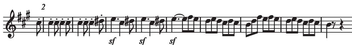
Example 1.1: Theme 1P

The overriding motivic feature of this movement is the upbeat quaver downbeat crotchet rhythmic unit. This forms the basis of the first theme, and is reversed for the second theme. The polyphonic opening is constructed largely with the use of paired voices, dividing 1P into four phrases as follows: violin with left hand; right hand with violin; both hands of the piano; violin and both hands of the piano. This creates what starts as a reasonably tightly woven texture with a major third between entries in the first and second phrases, spreading to a compound sixth in the shorter third phrase, and ending up with the tightly woven running thirds from the second half of the motif combined with a bass-line for the fourth phrase. These four phrases establish the brillante feeling of the movement, and delay the arrival of the confirming A major perfect authentic cadence (PAC) until bar 28. 78