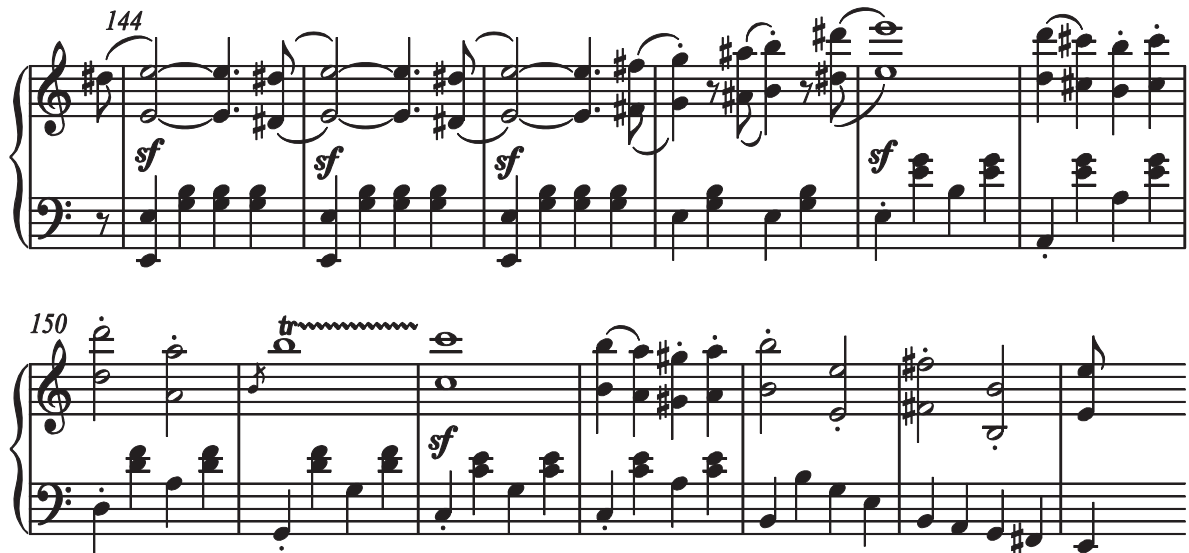
Example 1.7: Theme 2S

The development opens with a reprisal of 2S from the piano, this time in F major. Being the subdominant of the relative major this immediately turns the tension from the rather forceful cadential section at the end of the exposition into a relaxed mood, foreshadowing the opening theme in the second movement. 100 This brief respite does not last long; a mere six bars later the E flat at the upper limits of the keyboard followed by the chromatic rising bass line a bar later in bar 200 begins a rapid descent back to the ominous minor mode of the initial 2S entry. This time however the theme takes on the darker colours of G minor at bar 202, and is marked piano in the original – a distinct contrast to the much stronger earlier version which was also littered with sforzandi . The addition of a driving Alberti figure in the right-hand of the piano adds momentum and propels the development into a