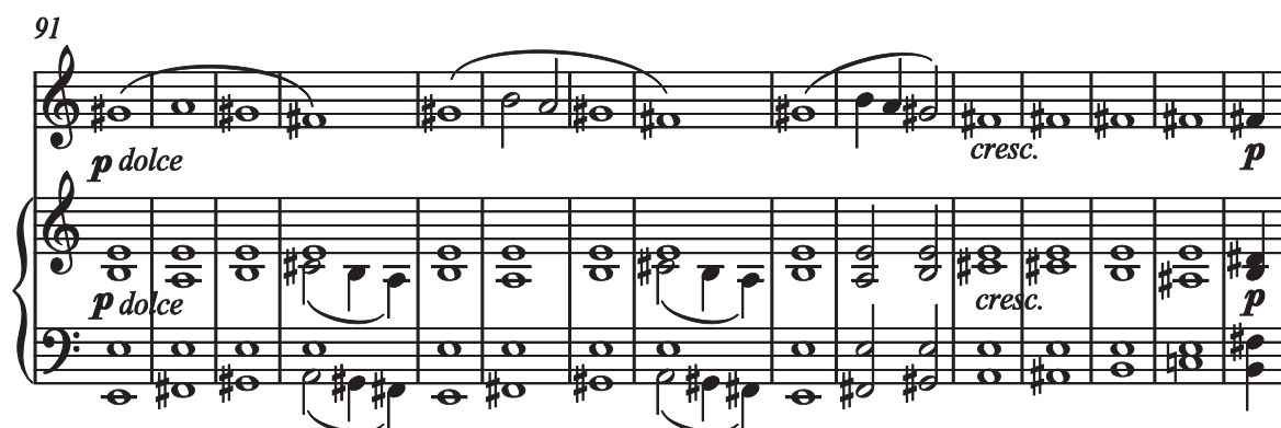
Example 1.6: Theme 1S

2S (example 1.7), firmly in E minor, arrives in bars 144–156. The rising semitone upbeat motif from 1P forms the basis of this theme, and the first statement occurs in the piano. 97 The violin repeats the theme in bars 156–167; there is a repeat of the last four bars in bars 168–171, which then repeat again (bars 172–175) but with modified harmonies and figuration (alternating octaves in the piano for just the theme itself without just a bass line instead of fully-realised broken chords) 98 before the closing section of the exposition begins in bar 176. This closing section 1K is based upon 2P, although it is now in E minor, and features a sforzando on every downbeat from bar 184 to bar 189. Interestingly