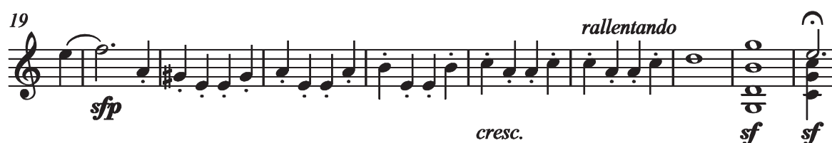
Example 1.4: Theme 1P

The transition to the secondary tonal area begins in bar 61. This consists of material adapted from 2P, and shifts first in four bar groups from A minor through relative major C