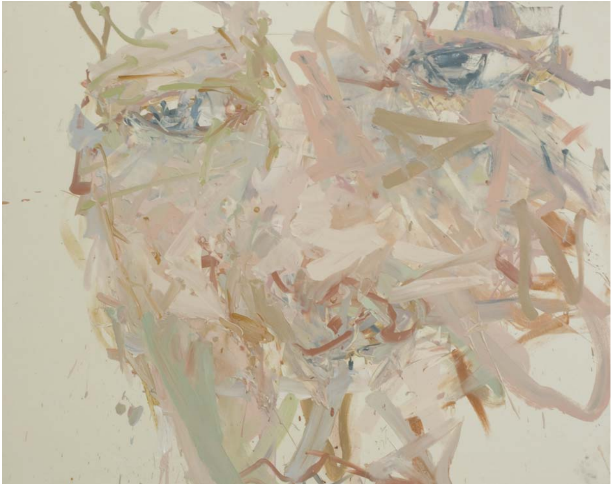
Figure 6. "Odessa no. 1" oil on canvas, 1170 x 1460 mm (first layer).