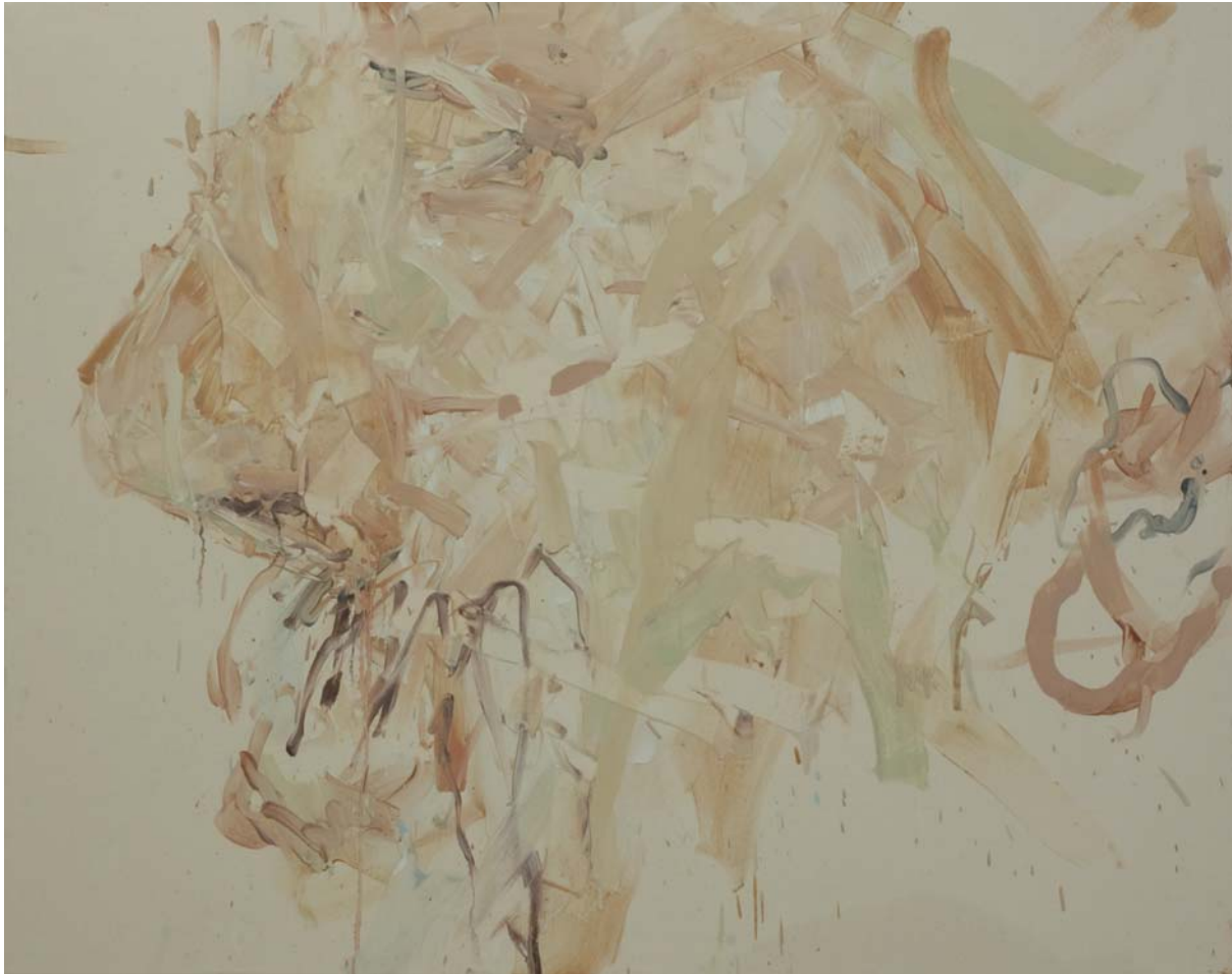
Figure 14. "Richard no. 4" oil on canvas, 1170 x 1460 mm (first layer).