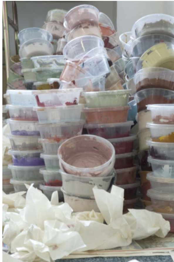
Figure 15. Studio Floor II, Massey University (January 2012).

My feelings toward the arts and toward painting in particular come from a very personal and intimate place, and may not fit the staple of today's amorous art viewer. A gap of literal meaning may well present itself to viewers of my work, some looking for the conceptual hinge, for this or that pictorial cue that indicates features of identity or impending culture. I am happy to give this viewer little, if anything to go on. The place of the body in my work, that of my own perceptual body and that of my peering subject, articulates an ongoing validity, a "visceral" quality of apprehension, a study of the simple fact of presence. I hope the work will always continue to surprise and, quite frequently, elude me, its consistency and "simplicity" the result of days of hours looking for a cadence of those "right" mistakes—that particular fusion of marks and gesture that coalesce into a fragile, "precarious" experience of a face or person. This position perhaps marks a weather-worn hermetic stereotype of the artist, but one with some rather esteemed company, as I hope this paper shows.