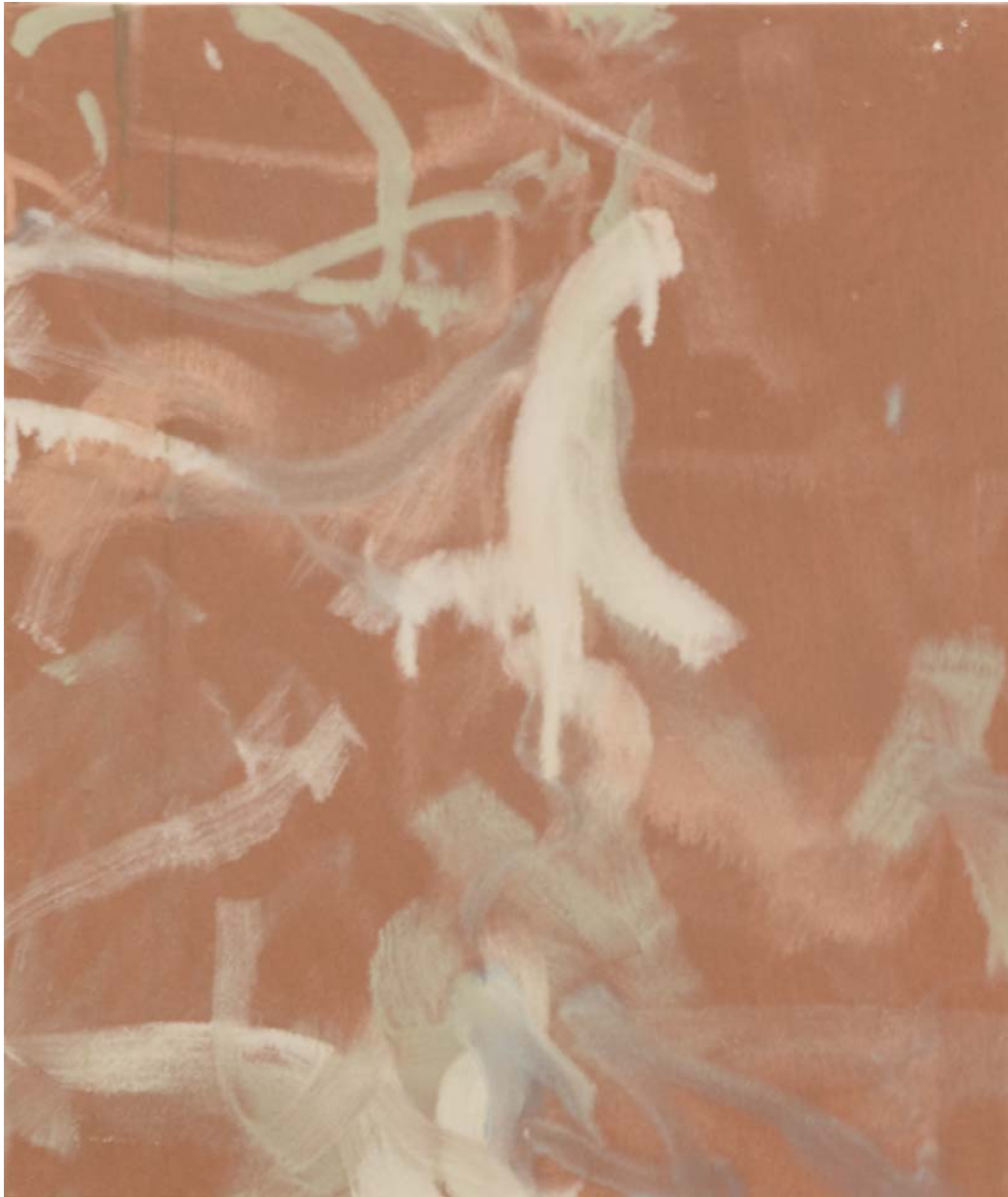
Figure 1. "Study no. 7" wax and oil pigment on canvas, 450 x 390 mm.

self and the body of the other. This fluctuation or immersion brings meaning to the gestures one makes: