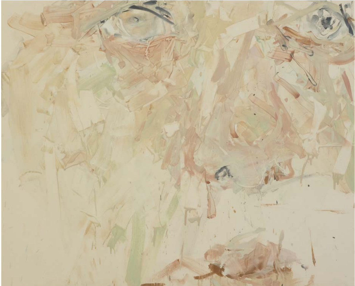
Figure 13. "Richard no. 3" oil on canvas, 1170 x 1460 mm (first layer).