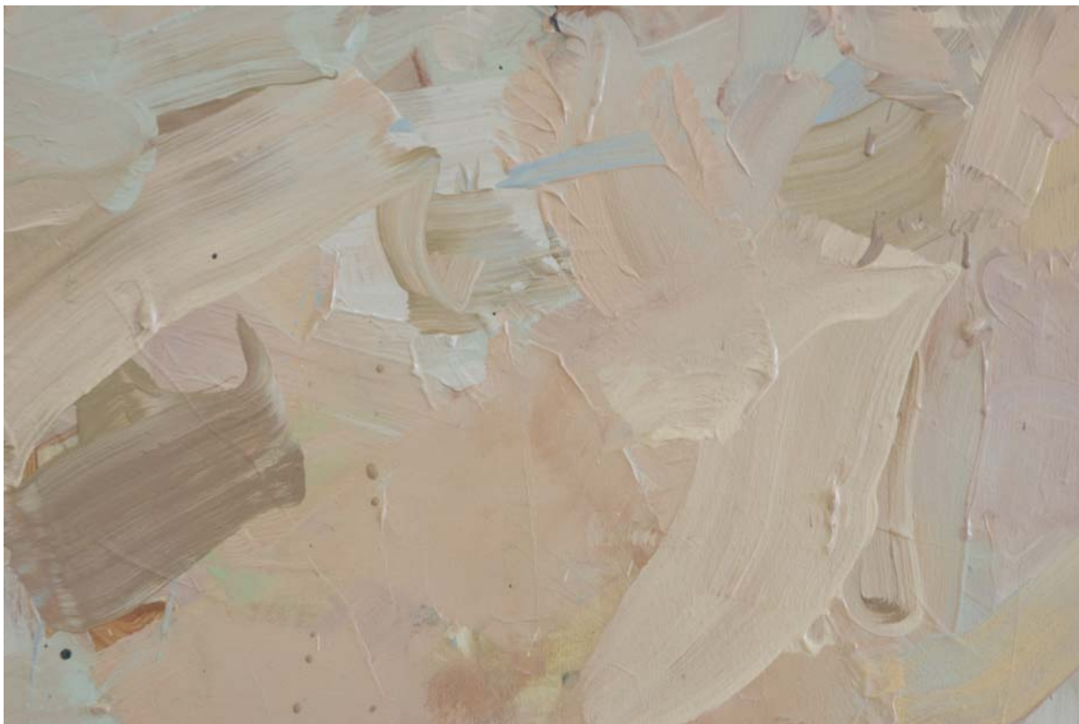
Figure 8. "Sarah no 1." oil on canvas (second layer—detail)