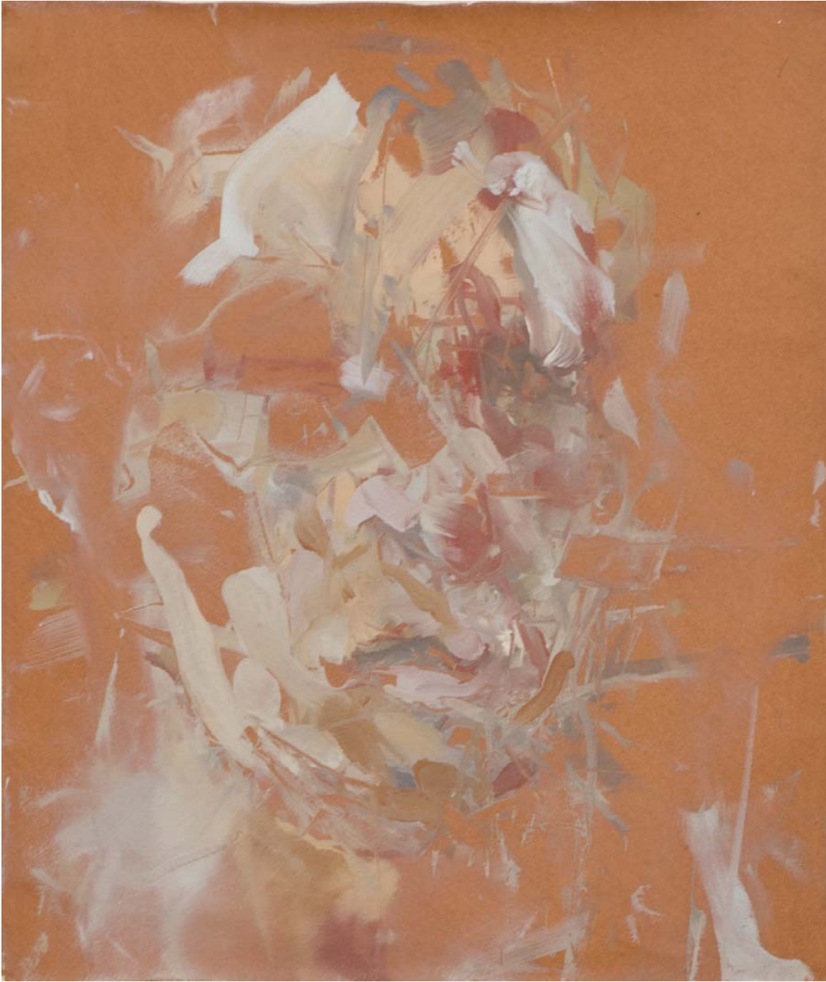
Figure 2. "Study no. 8" oil on canvas, 450 x 390 mm.