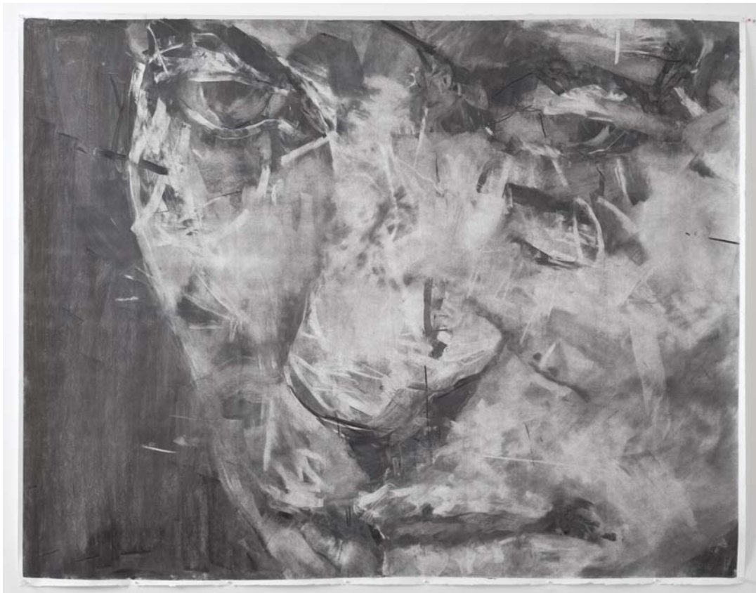
Figure 10. "Louise" charcoal on paper, 1170 x 1460 mm (2011) (Image Stephen A'Court).