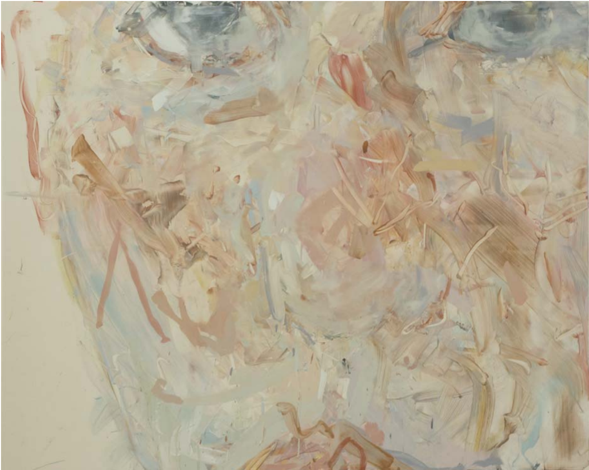
Figure 7. "Shiloh no. 3" oil on canvas, 1170 x 1460 mm (second layer).