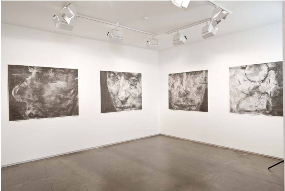
Figure 9. "Draught" exhibition view, Bowen Galleries, Wellington NZ, June 2011.