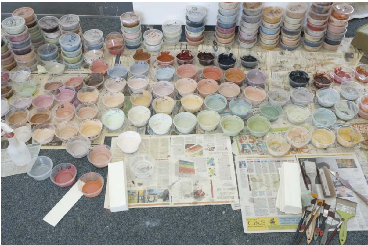
Figure 11. Studio Floor, Massey University (January 2012).

ochres that modulated and held the space from colour to colour. How could I have been so blind? Could such a basic chromatic shift open the depth of the painting? I was eager to find out. I had always mixed my own colours—up to about forty to fifty or so, both in glaze and thinned [fig. 11, this page]—in preparation for each painting and had begun a process of “in-palette” mixing to modulate areas within certain chromatic fields, to hold the painting together for the ever-precarious passage of the eye. My journey towards yellow was a subtle one—I mixed a range of light greens, heavy with mars yellow, and the work began to open, ever-so-slowly [fig. 13, p. 34]. At this time I also started thinning the glazes to give as much voice to the ground as possible [fig. 12, p. 30]. The technical considerations primarily clarified the dynamic range of the painting process—to expand its register as much as possible.