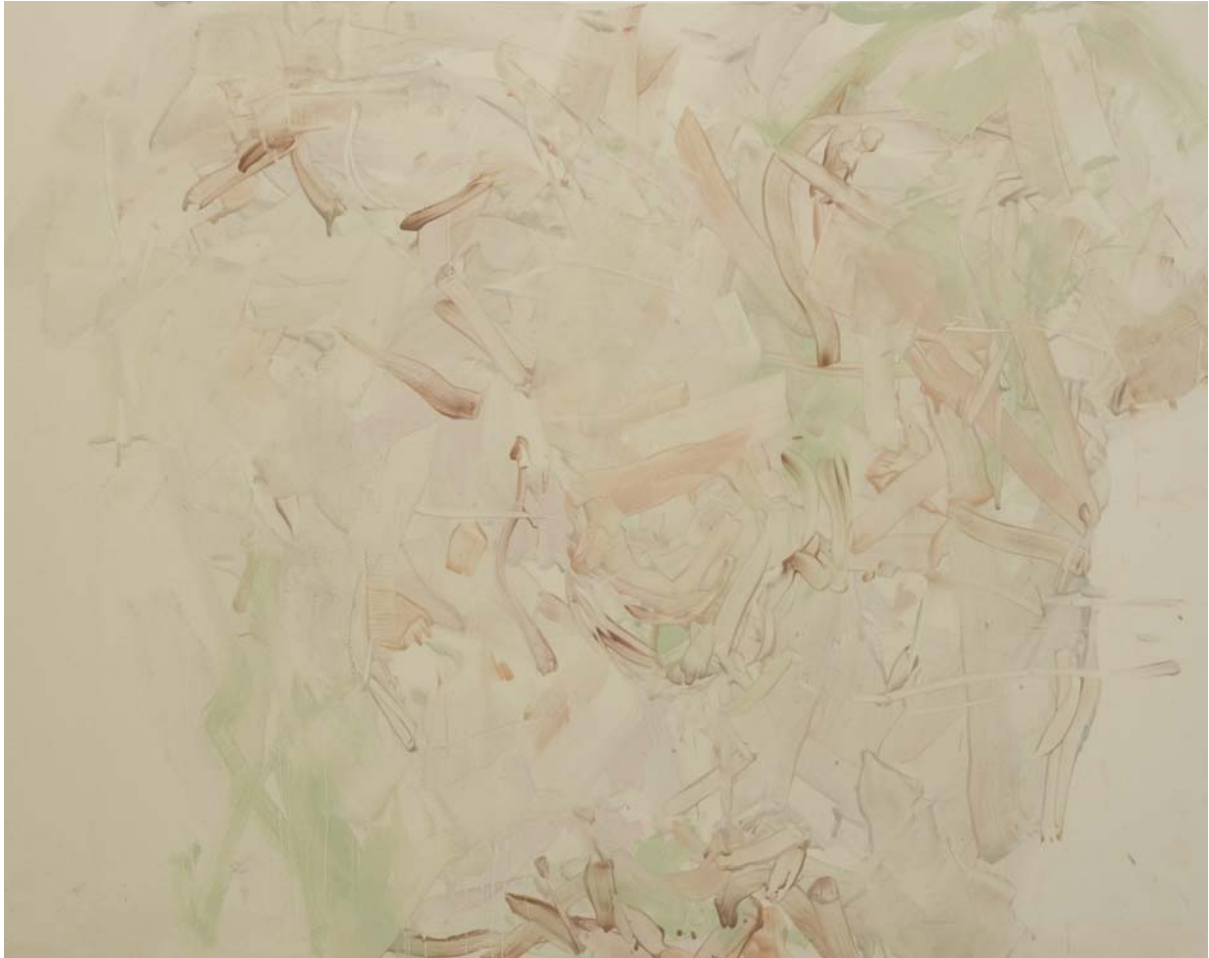
Figure 12. "Reflection no. 8" oil on canvas, 1170 x 1460 mm (first layer).