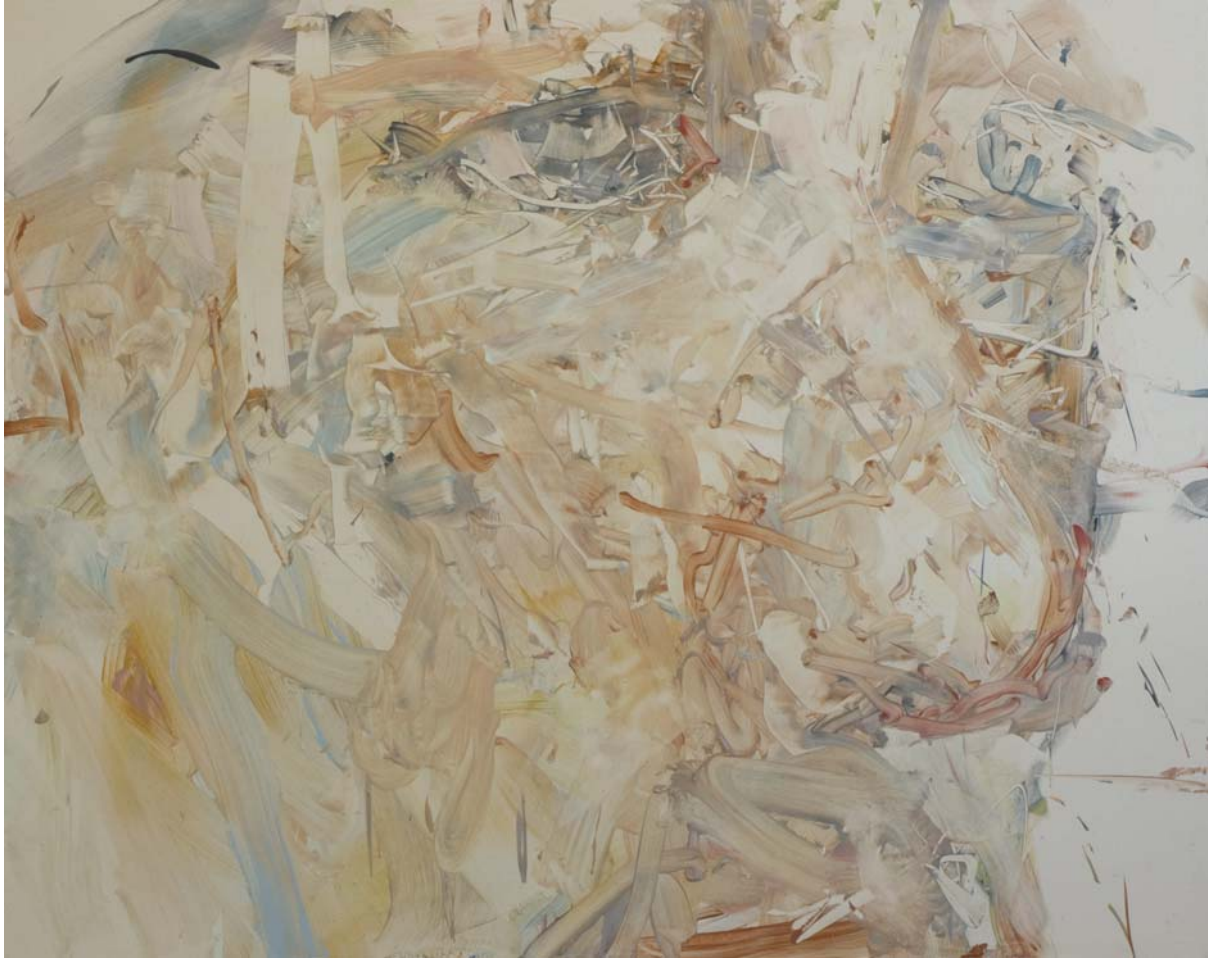
Figure 4. "Sarah no. 1" oil on canvas, 1170 x 1460 mm (first layer).