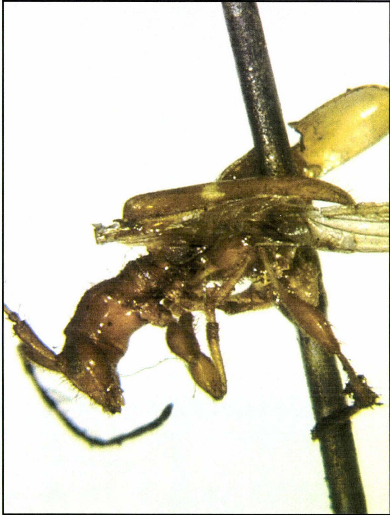
The holotype of Zorion minutum Fabricius 1775 collected by Joseph Banks during the first voyage of Captain Cook to New Zealand, 1769-1771, held at the Natural History Museum, London