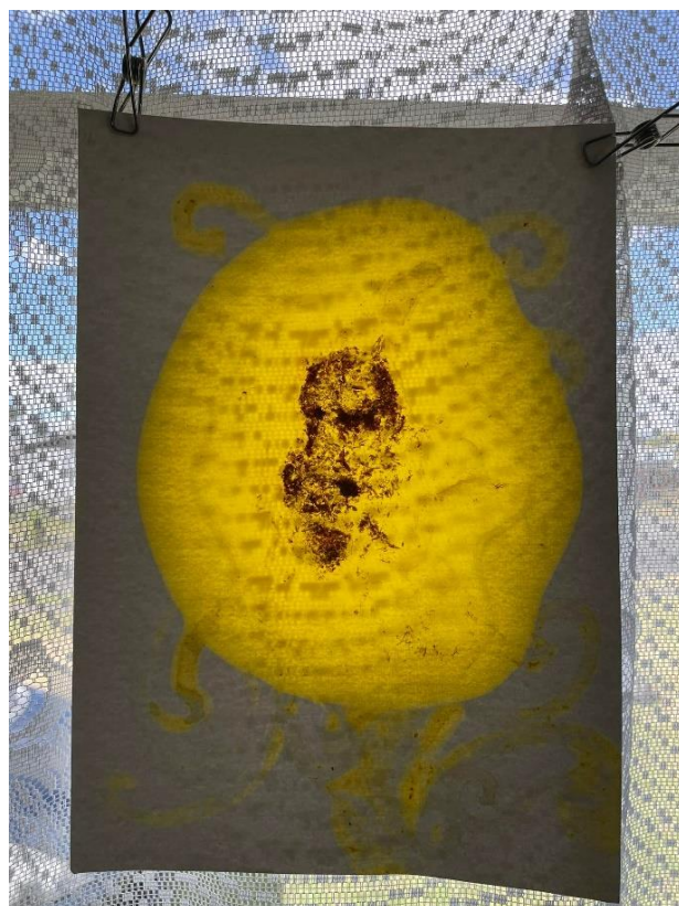
Whakaahua 11 Whakamātautau: Kua rewa (2022)