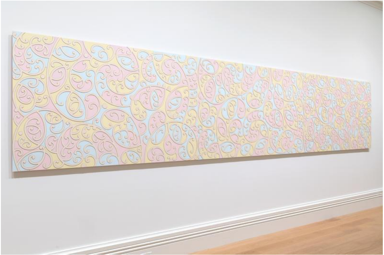
Whakaahua 6 He Ata ki Runga, He Ata ki Raro (2020)

Nā i te tīmatanga kāore ahau i kaha aro ki te mahi nei, engari ka kite i te tuhinga nei, ko ngā wāhanga kei tēnā, kei tēnā o aku mahi, kua kapohia mai He Ata ki Runga, He Ata ki raro . Heoi anō ehara i te mea koira tāku i whai ai i te tīmatanga o aku mahi, engari nā taku noho tahi ki te tauira hukihuki o He Ata ki Runga, He Ata ki Raro , me kī i whai wāhi māua ki te wānanga, mō ōna tini wāhanga i ngā wā i uaua te rere o aku mahi mō te tuhinga whakapae nei.