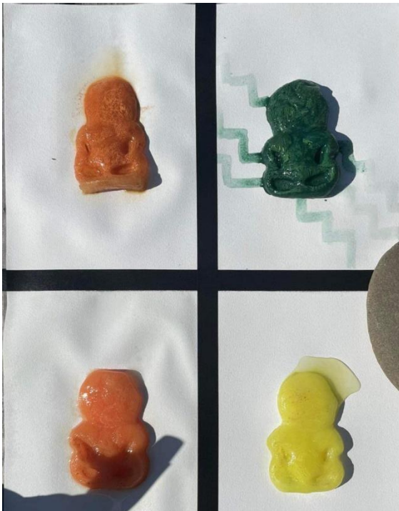
Whakaahua 9 Whakamātautau (2022)