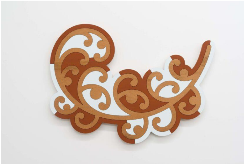
Whakaahua 4 Te Kura Awhitia te Nuku (2022)

Ko Te Kura Awhitia te Nuku , tētahi o āku tino mahi nō te kahui mahi nei, ko tōna āhua he rite tonu ki te rau, ki tētahi tipu rānei. Ko te rere o te koru, te nohonga o te pītau ka tino tau te rongo i te tirohanga atu. Otirā ko ōna tae, arā te nohonga tahi o te kikorangi me te parauri he ahua rerekē ka pā mai ki wairua. Nā ko ngā tae nei he rite tonu ki a Rangunui rāua ko Papatuānuku anō hoki.