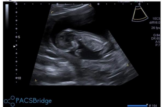
Whakaahua 14 Mātai o Kimura (2022)