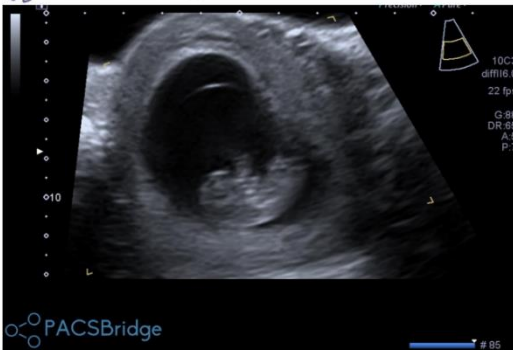
Whakaahua 12 Mātai o Kimura (2022)