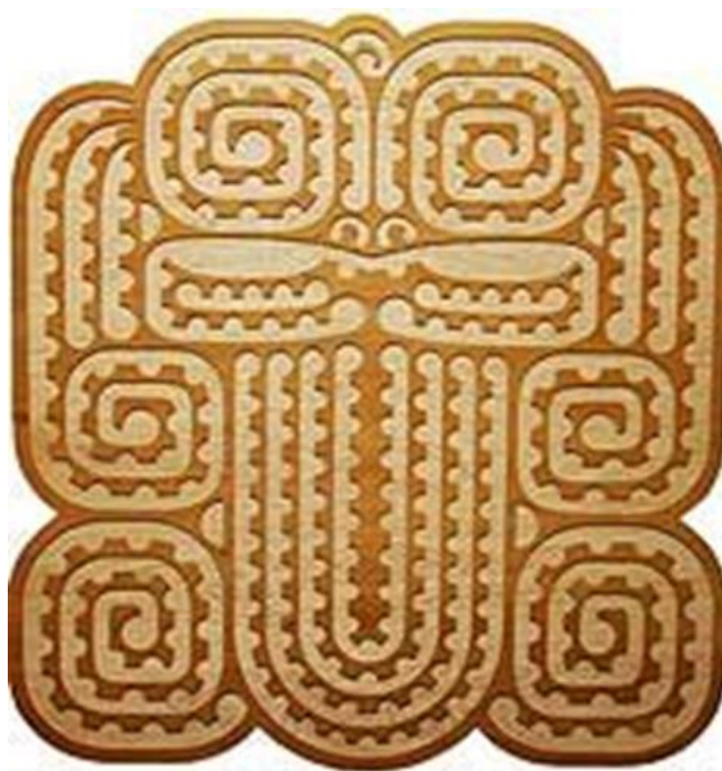
Whakaahua 3 Te Pītau a Tiki