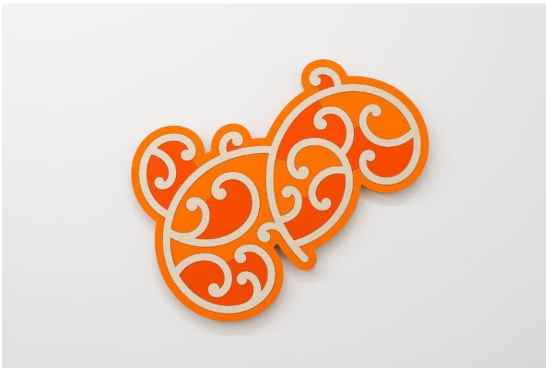
Whakaahua 5 Te Kura Mātiti (2022)

Ko Te Kura Awhitia te Nuku , tētahi o āku tino mahi nō te kahui mahi nei, ko tōna āhua he rite tonu ki te rau, ki tētahi tipu rānei. Ko te rere o te koru, te nohonga o te pītau ka tino tau te rongo i te tirohanga atu. Otirā ko ōna tae, arā te nohonga tahi o te kikorangi me te parauri he ahua rerekē ka pā mai ki wairua. Nā ko ngā tae nei he rite tonu ki a Rangunui rāua ko Papatuānuku anō hoki.