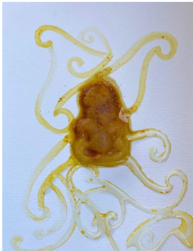
Whakaahua 10 Whakamātautau: rewa tonu (2022)

I te wāhanga tutahi ki te tuarua o taku haputanga i kaha tonu taku whakamātautau, me te waikano. Otirā i tino ū ahau ki ngā hanga kōwhaiwhai me te tiki. Mōku anō i tino hono ēnei āhua ki taku kaupapa mahi. Arā ko te kōwhaiwhai, he nui tonu ōna tikanga, hēoi anō nā runga i te āhua, tōna whakatakoto he rite tonu ki te whenua kei te kōpū o te whaea, waihoki i kitea he hononga ki ngā kōrero kei Te Aho Matua mō ngā āria rerekē ka tō ki te tamaiti. Ko te tiki e hono ana ki te kōngahungahu, otirā ki te ira wahine. Ko te whakaahua 12 te mahi tuatahi i waihangahia, otirā i noho tēnei hei tauira hukihuki mō aku mahi mō te tuhinga whakapae nei.