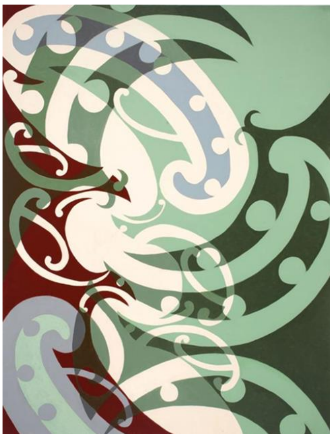
Whakaahua 1 Tenei au, tenei au (2006)