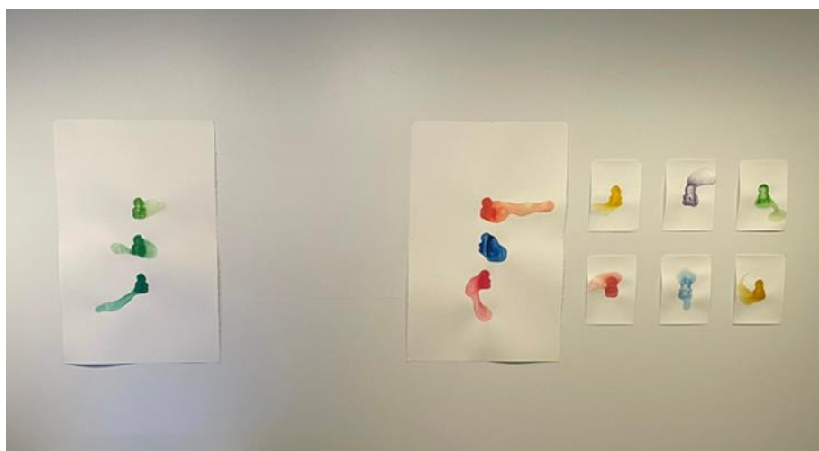
Whakaahua 7 Te Koero Whakanao (2021)

He kohinga mahi tēnei i whakaritea e au mō te tau tutahi o MMVA. E waru ngā mahi waikano (Whakaahua 7) kei te kāhui nei, ā, kōtahi te ripene ataata (Whakaahua 8). Ko ngā peita waikano, peita tangata, kua irihia me ētahi pini iti ki runga i te pakitara o te whare. E rua ngā rahi rerekē, arā, ko te A3 me te 56x76cm anō hoki. Ko te ripene ataata kua tukuna ki runga i tētahi pouaka whakaata 50 īnihi te rahi, hei tapiri ake ki tēnei ko te pouaka whakaata i whakatakotohia ki roto i tētahi momo tēpu ki a wawe te takato o te pouaka whakaata ki runga i te papa. Ko te ripene hei whakaatu i te tio e rewa ana ki runga i te pepa waikano, ko tēnei e hono ana ki ngā tikanga whakanao me te wai, ā ko ngā mahi peita he waihotanga nā te tio kua rewa.