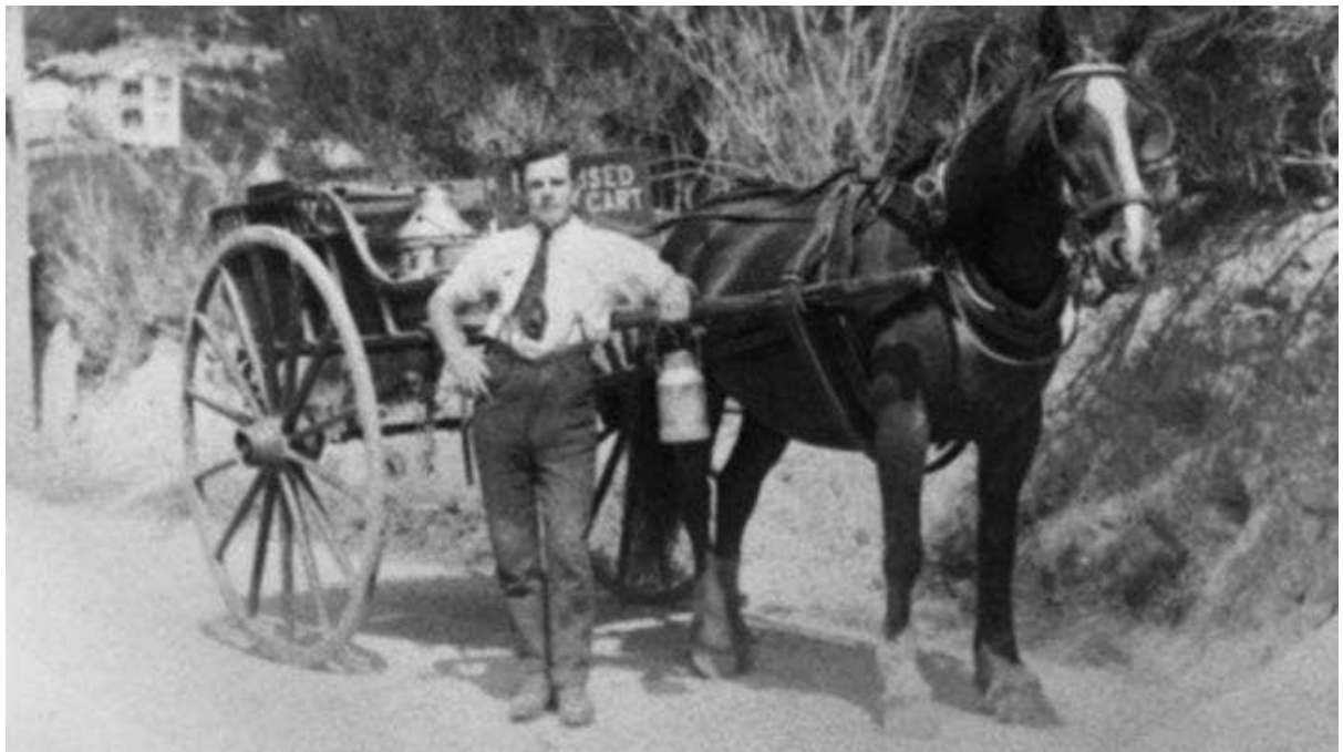
ALEXANDER TURNBULL LIBRARY 1/2-107552-F