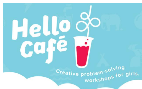
FIGURE 1 THE BRANDING OF THE OUTREACH PROGRAM

To ensure we sparked interest from this target group of young girls, we took an unusual approach about how we marketed our program. Typically large/national outreach programs targeted at girls tend to have a similar marketing approach. Usually the name of the program has some connotation with science or technology and it is very clear from the outset that the program supports STEM. For example, “Techbridge” 17 began as a program of the Chabot Space & Science Centre in California, which “inspires girls to discover a passion for technology, science and engineering. Through hands-on learning, we empower the next generation of innovators and leaders”. We specifically marketed our program so that on first impression girls would not associate it with engineering or technology. We call this “engineering education by stealth”. For example, we have purposely chosen the name “Hello Café” 18 as we wished it to convey a welcoming program in an environment that is relaxed and friendly. Our brand is fun, using colors that young girls can typically connect with (Figure 1).