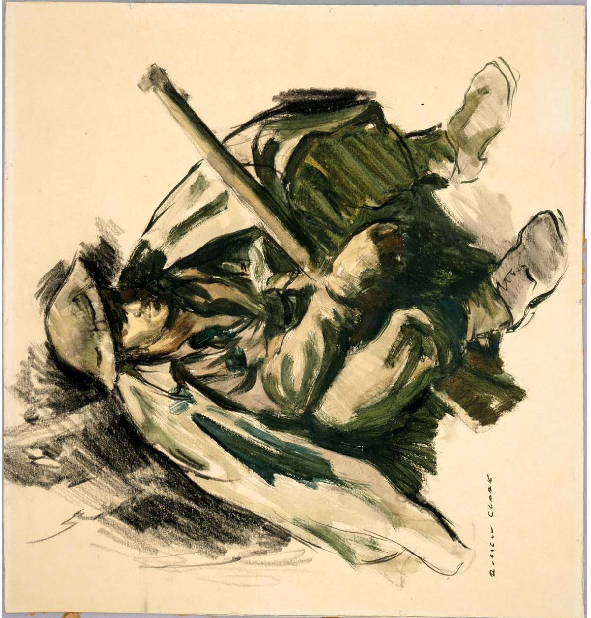
PAINING BY RUSSELL CLARK STUDY OF SOLDIER, MONO ISLAND - ARCHIVES NZ AAAC898NCWA153 898