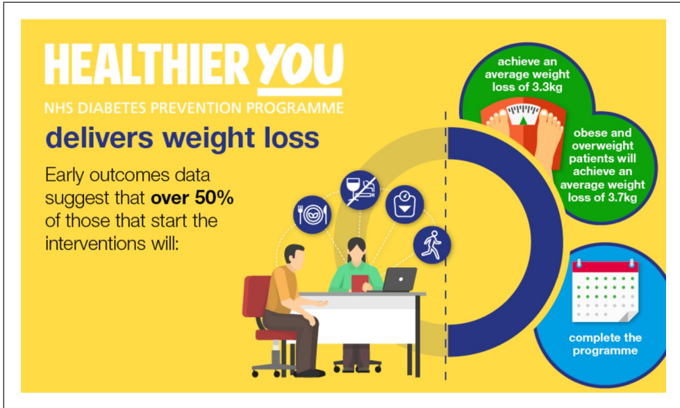
Figure 3. Clinical practice guidelines for Type 2 Diabetes. 101