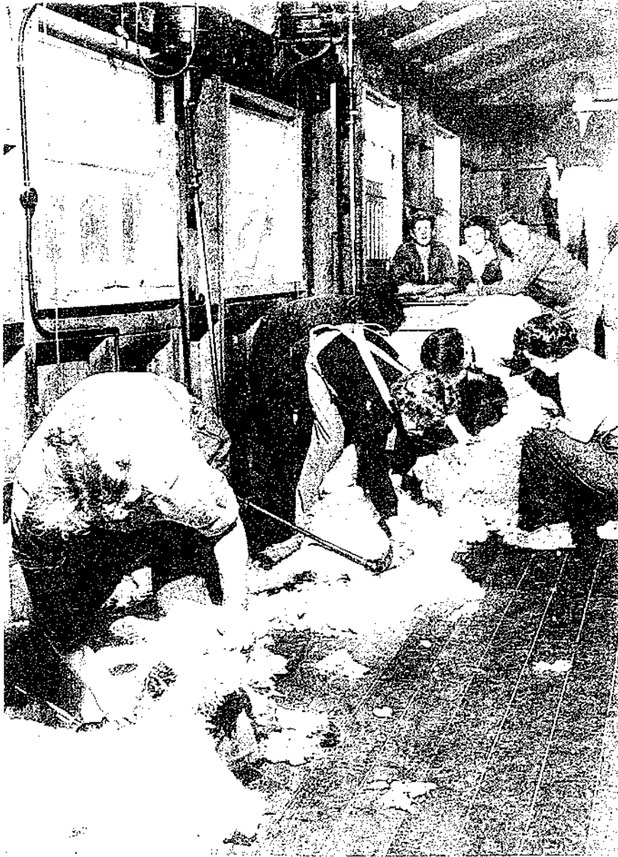
'Women Shearers - Learning the job'. Many of the male students believed that the women were not as able practically and waited for them to prove themselves before they gave their full acceptance.