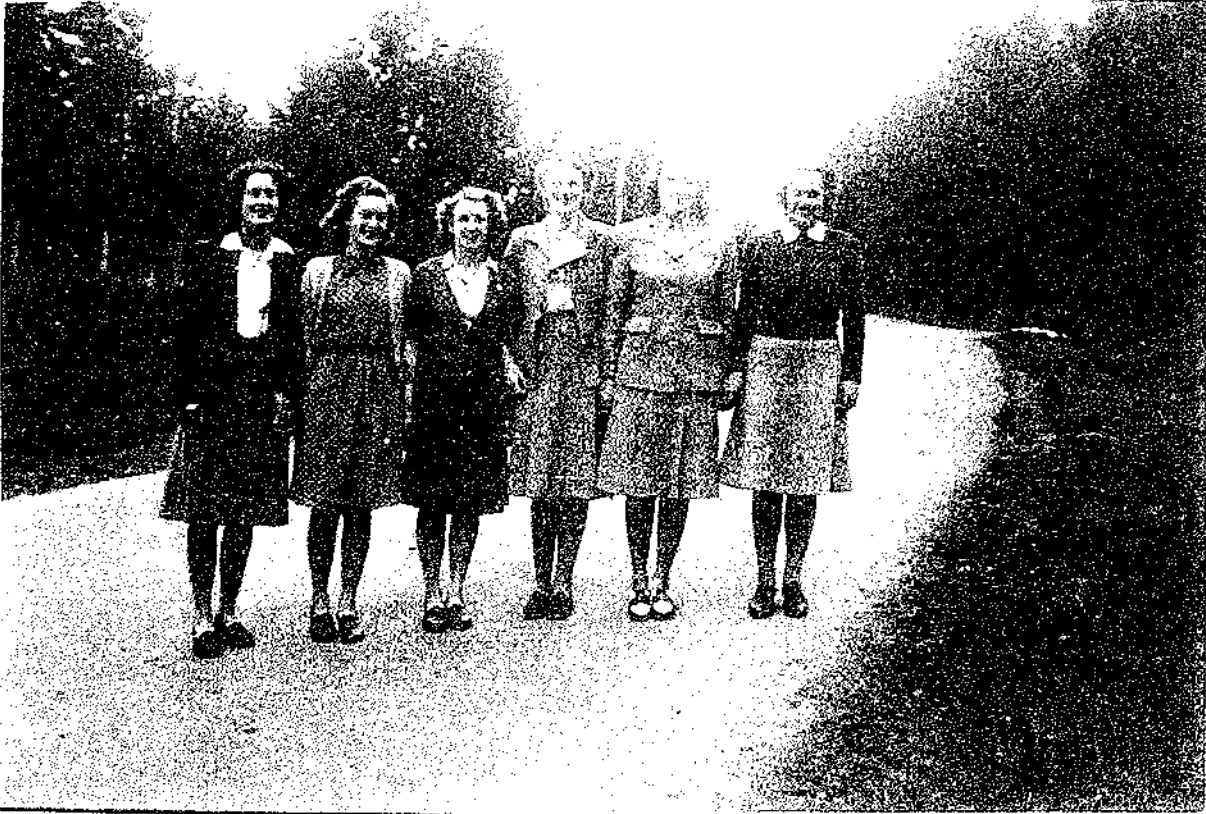
Pretty maids all in a row: Women students on the drive up to Massey. Women really only became a visible group when the horticulture course began in 1944.

The reasons behind women students entering Massey Agricultural College were many and varied but some similarities emerge. Socio-economic background, education and strong women role models would appear to have been factors in their entering this seemingly unfeminine domain. Noticeably, it was rarely a career option that was recommended to them from elsewhere, particularly their schools.