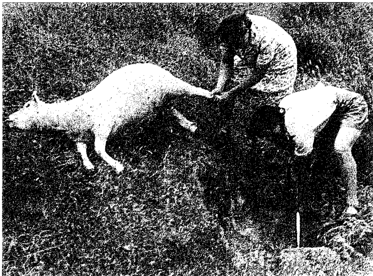
'Digging a grave on the Pahiatua Block'. Women students took exactly the same course as men and were expected to pull their weight. (Source: Photographic collection, MUA, circa 1940s?)

The College was a product of its time. While it would seem to have been forward thinking in talking of how to encourage more women as students, it could only imagine women within set parameters. This then required them to develop courses that would be of interest to women. With domesticity and maternity their natural sphere and jobs but a stopgap to marriage, it was natural that the College extended the secondary school focus in developing courses around these themes. Massey was foremost an agricultural college, with the implication that this was for people living, or intending to live, in the country. Awareness of the concern for ‘...the drift from country