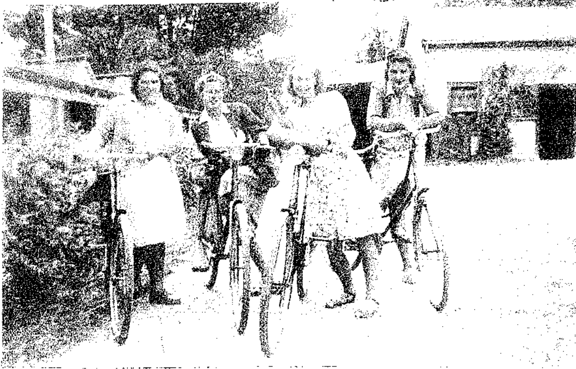
'Off to the Meyricks'. Bicycles were an indispensable part of the women's social life, at least until the late fifties. They took the women all around Palmerston North, day and night.

Some of the more memorable aspects of tertiary education have traditionally involved life outside the classroom, and the 'learning' that goes on in less formal contexts.